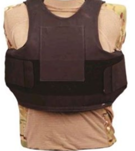
TYPE 2 STAB-ONLY LEVEL