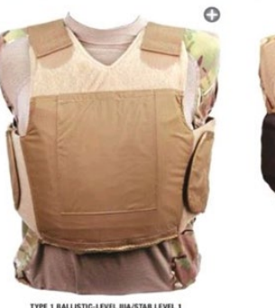
Family of Concealable Body Armor (FoCBA)