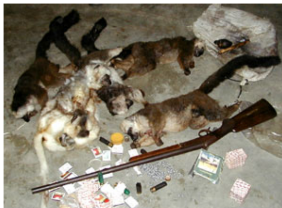
Figure 2: Slaughtered lemurs.

Historically, as for other lemurs, the greatest conservation threat to the silky sifaka has been cultivation of hill rice through slash-and-burn agriculture or “tavy” (Mittermeier et al., 1994). Although human hunting of primates in Madagascar is generally less widespread than in Africa or Asia (Cowlshaw & Dunbar, 2000), nevertheless in some parts of Madagascar, such as Marojejy National Park, steady lemur poaching is evident. Tattersall (1982) suggested hunting must be occurring, given that the most accessible parts of Marojejy seemed “largely bereft of larger mammals and birds”. Duckworth et al. (1995) found numerous lemur traps and “villagers said that lemur hunting is their main reason for penetrating the reserve” (p.556). More recently, Goodman (2000) identified many human trails utilized by local people during lemur hunting, to gain access to hidden agriculture, and to harvest forest plants for medicinal and construction purposes. In