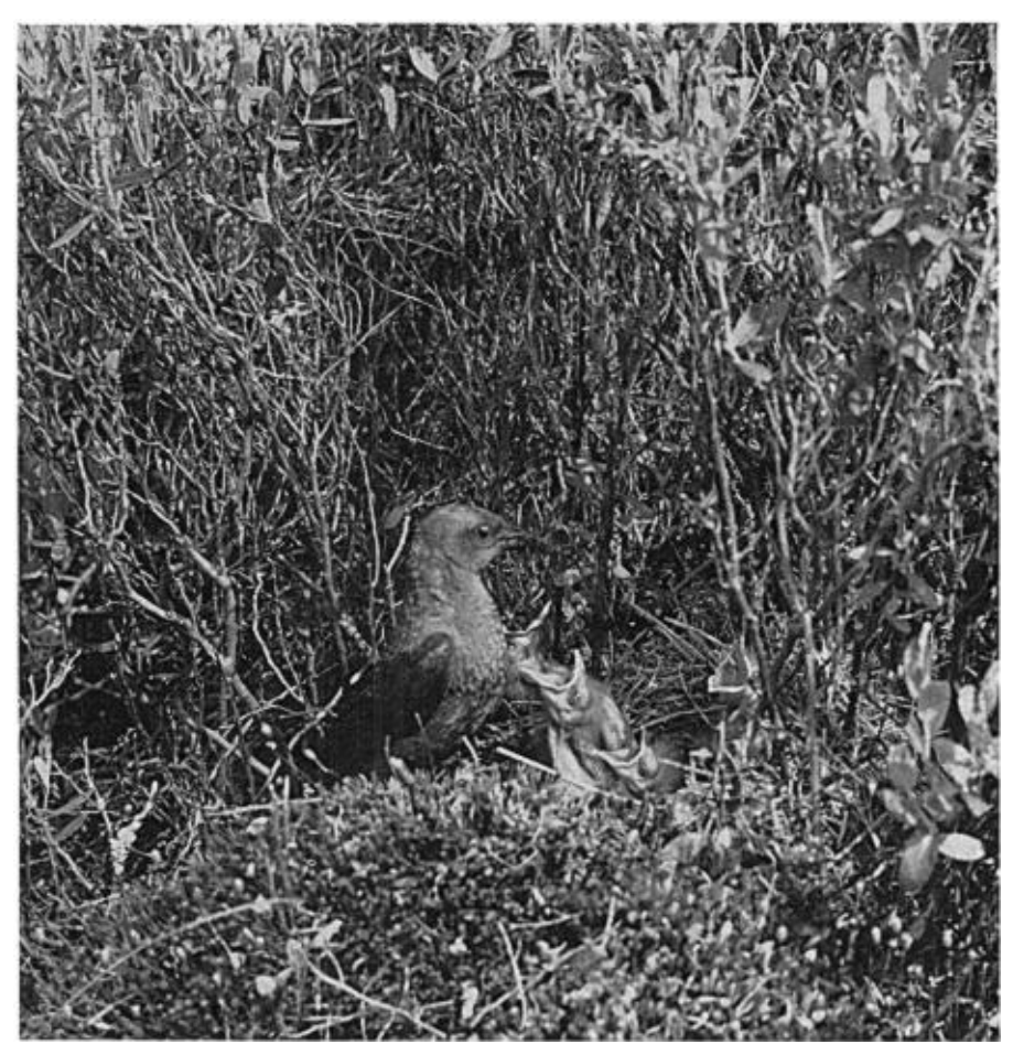
Fig. 3. Female Brewer Blackbird at nest in leatherleaf bog, Luce County, Michigan, June 22, 1956.

Wing saw a male on May 15. Wing and Walkinshaw found a nest there four days later. The species has not yet been found breeding farther east in Michigan.