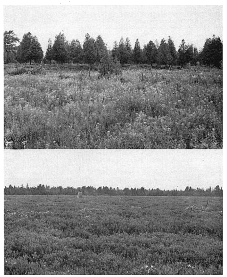
Fig. 2. Upper: damp field nesting habitat of the Brewer Blackbird near New Era, Oceana County, Michigan, 1953.

Lower: bog nesting habitat of the Brewer Blackbird near the Fox River, Luce County, Michigan, June, 1956.