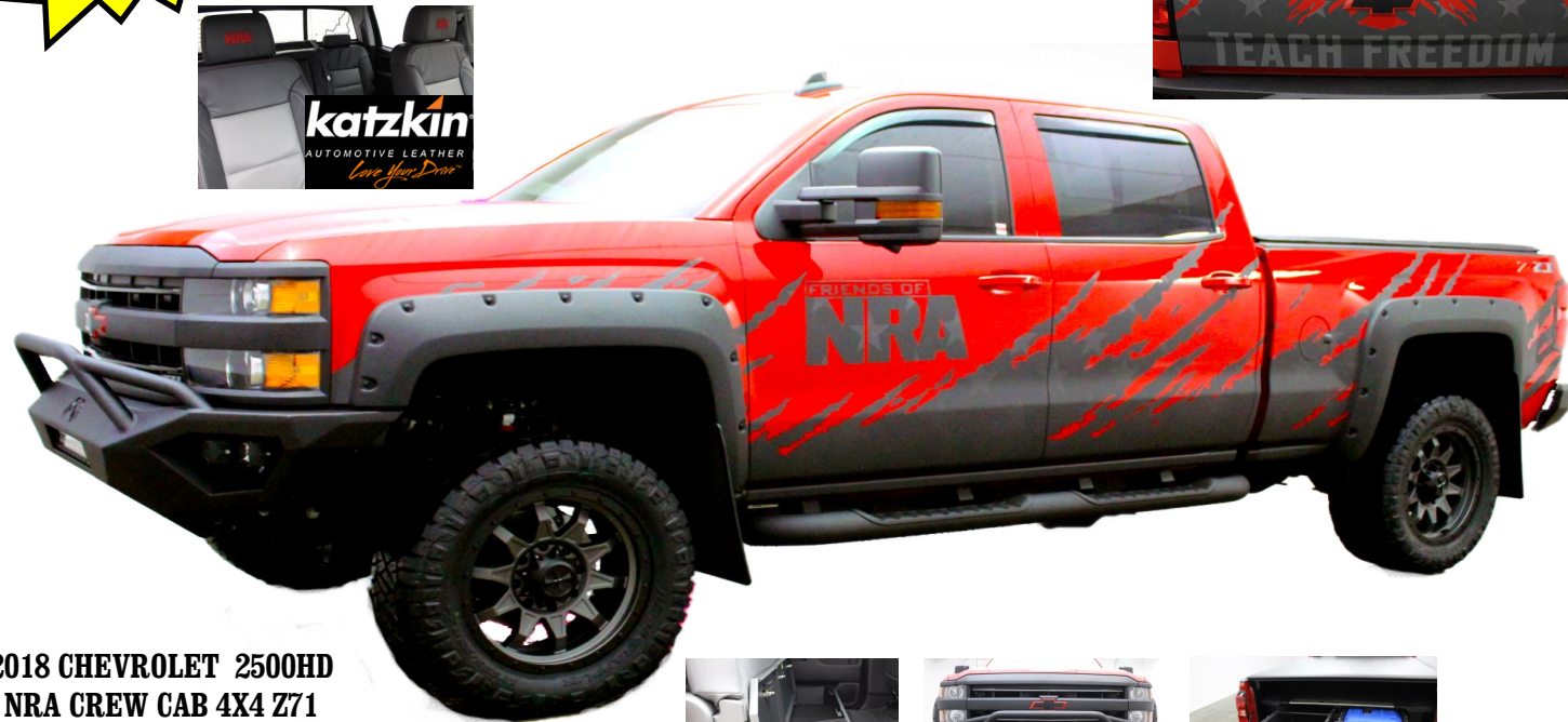
2018 CHEVROLET 2500HD NRA CREW CAB 4X4 Z71