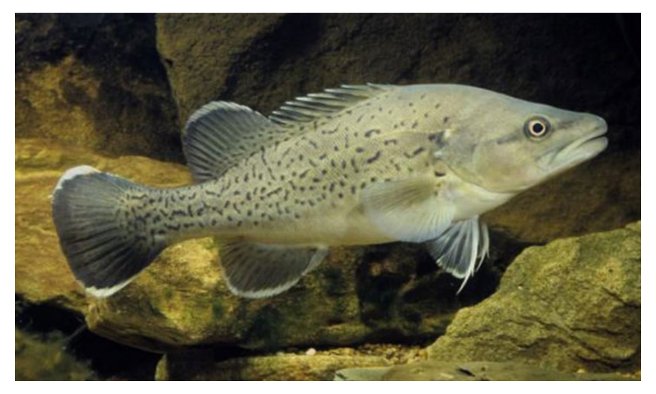
The Australian Trout Cod ( Maccullochella macquariensis ), which has improved status from Endangered to Vulnerable. Decades of conservation action have focused on establishing additional subpopulations through reintroductions and wild-to-wild translocations.

Many species have been saved from extinction or had their status improved, native species and ecosystems have recovered, and habitats have been restored and rewilded, due to effective conservation action. Recent decades have seen an impressive array of scientific innovation and technological advances – including in genetics, remote sensing, GIS mapping, camera trapping, satellite tracking, acoustics, statistical analyses, and modelling that improve our ability to monitor and conserve wild species and their habitats.