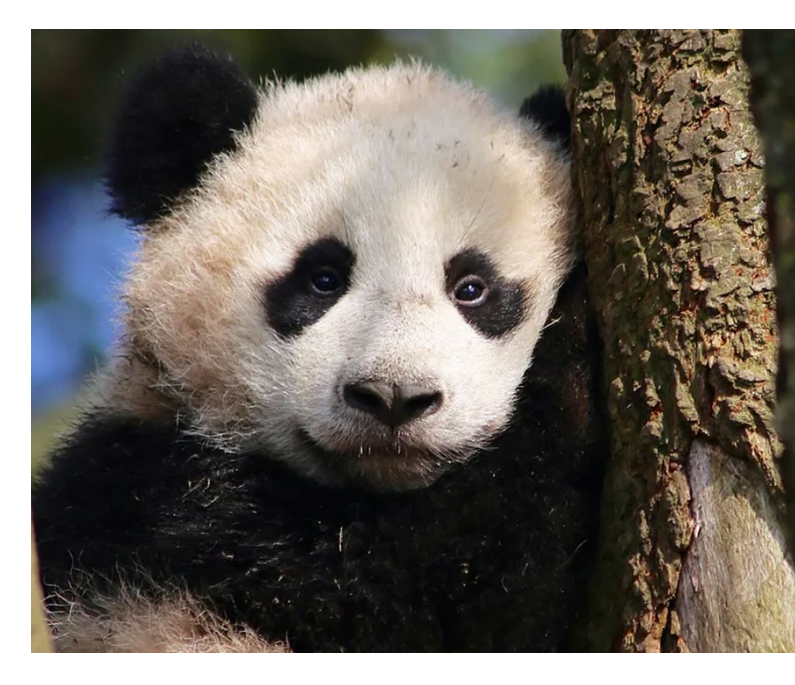
Giant Panda populations have increased so significantly they are no longer listed as an 'endangered species' on The IUCN Red List of Threatened Species™, although they are still vulnerable, with less than 2,000 remaining in the wild. This is due to habitat conservation, including reducing fragmentation and reconnecting isolated populations, poaching prevention, capacity strengthening and community conservation. Communities in giant panda landscapes even collect wild plants in a 'panda friendly' way, which may end up in your 'detox tea'!

Ultimately the GSAP is an action plan for everyone - governments, intergovernmental organisations, the biodiversity-related conventions, international and national NGOs, Indigenous peoples and Local communities, academic and research institutes, ex-situ institutions (zoos, aquaria, botanic gardens), commercial and business sectors, funding agencies, the philanthropic community, and civil society as a whole: everyone has a part to play in addressing the species emergency and ensuring we pass on a rich natural heritage to future generations.