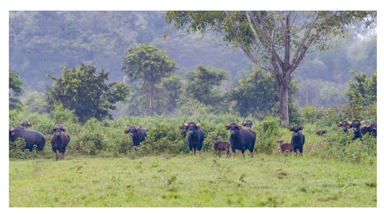
Wild gaur (Bos gaurus) gazing in Cat Tien National Park, Viet Nam.

review, technical and scientific cooperation, and digital sequence information on genetic resources. The Kunming-Montreal Framework sets out a pathway to halt and reverse biodiversity loss and put nature on the path of recovery, while ensuring the fair and equitable sharing of benefits from the utilisation of genetic resources, and providing means of implementation, in order to achieve the 2050 Vision whereby people live in harmony with nature. Enormous efforts and scaled-up action will be required to fully implement the Kunming-Montreal Framework and achieve the 2050 Vision.