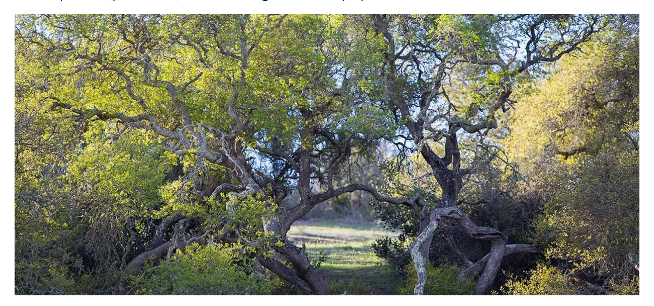
Anacapa Island: Several oak species endemic to the Channel Islands of California and Mexico were severely threatened by non-native livestock (e.g. goats and pigs) and invasive plants throughout the 20th century. A group of partners successfully removed the feral livestock from several islands, allowing seedlings to establish for the first time in decades, as well as removing invasive plants and planning fire regime management. Hundreds of seedlings have now been planted, with high survival rates.

emerging infectious diseases, all resulting from an array of underlying drivers. Erosion of genetic diversity is an additional, mainly unquantified threat, especially to very small and highly fragmented populations.