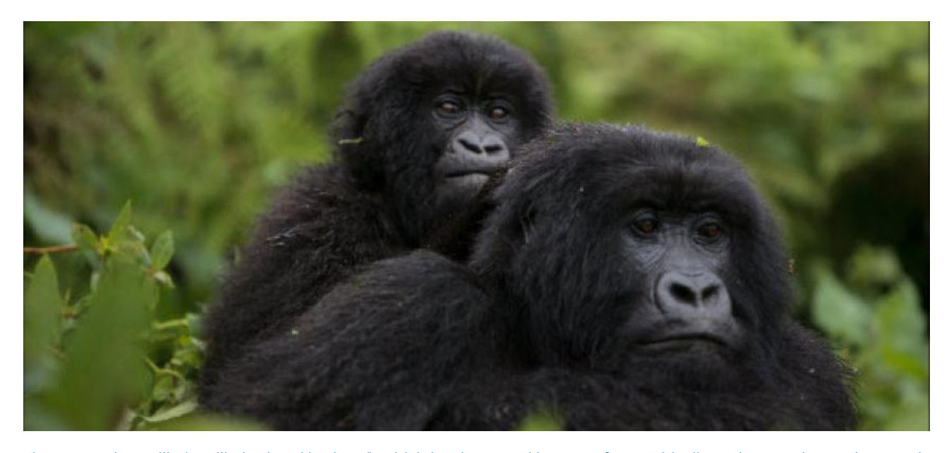
The Mountain Gorilla ( Gorilla beringei ), which has improved in status from Critically Endangered to Endangered thanks to collaborative conservation efforts across country boundaries with engagement from communities living around Mountain Gorilla habitat.

The primary threats to species identified in the IPBES global assessment are conversion, degradation, and fragmentation of natural habitats, unsustainable use and trade; climate change, invasive alien species, pollution, and existing and