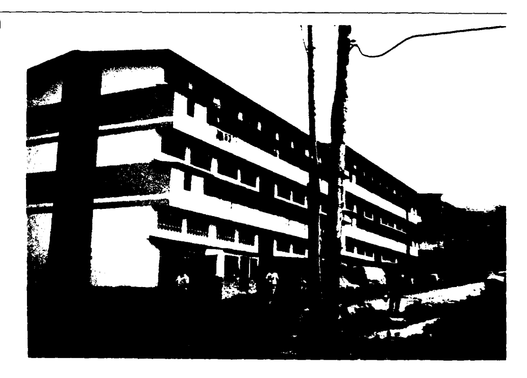
Figure II.1: Housing Similar to What Will Be Provided Those Who Choose to Return to El Chorrillo

In November 1990, we were informed that the Ministry of Housing revised its construction estimate and told AID it would have 128 units available by February 1991, at $6,500 each and another 100 units costing up to $12,000 each by April 1991. AID officials informed us that all those selecting this option will eventually be housed in El Chorrillo. However, those not housed through the first 228 units will have to find their own housing accommodations until additional units are built.