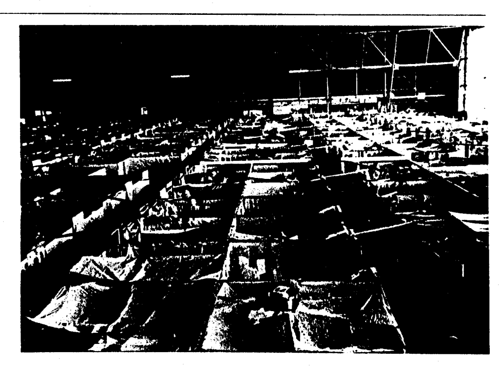
Figure I.2: Cubicles Inside the Albrook Facility

consisting of more than four members are provided additional cubicles. Figure I.2 shows the confining conditions at the Albrook facility as of August 1990.