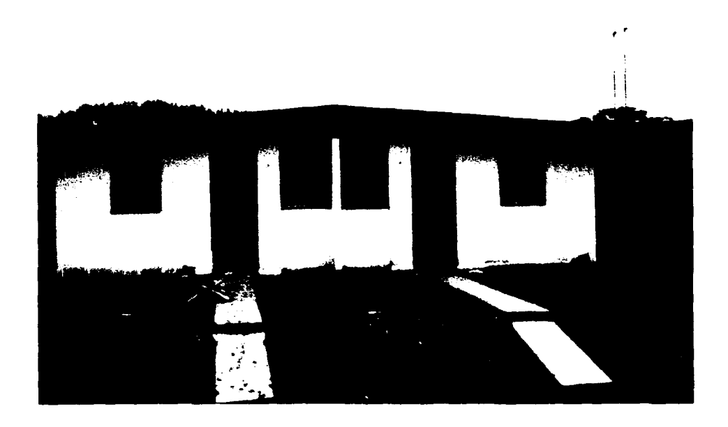
Figure II.2: Duplex Housing in Vista Alegre #2

developer. Figures II.2 and II.3 show two housing alternatives currently available to displaced families under this option. As of November 5, 1990, 946 family groups had selected this option.