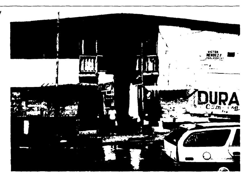
Figure I.1: Typical El Chorrillo Multifamily Residence Before the December 1989 Fighting

U.S. military personnel encouraged civilian residents to evacuate designated danger areas from the outset of the battle in El Chorrillo. By midday December 21, 1989, most residents had arrived in a displaced persons area established by the U.S. military on the grounds of Balboa High School, about 1 mile from El Chorrillo.