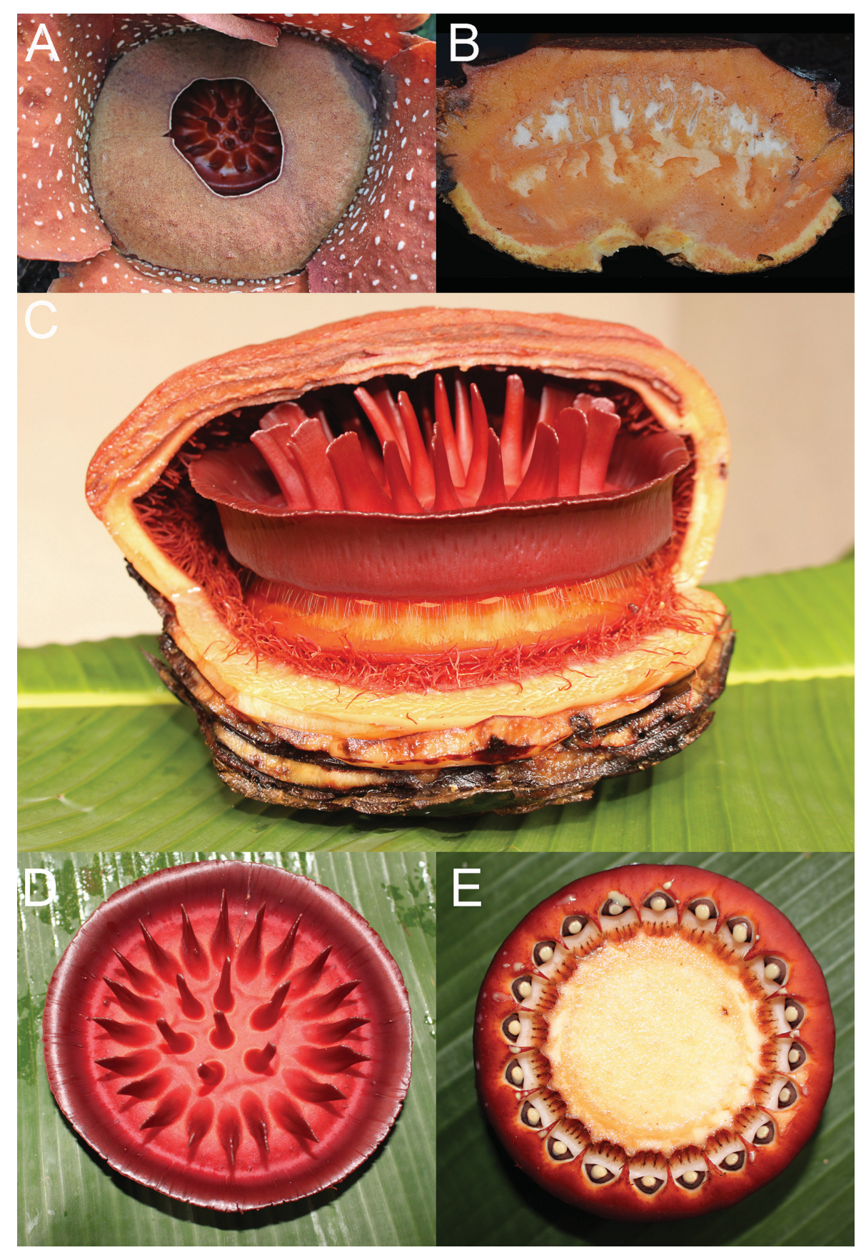
FIGURE 3. Rafflesia mixta . A. Open male flower showing partially visible disk processes through the diaphragm aperture. B. Longitudinal section through a female flower showing ovary. C. Bud with perigone lobes removed to show the short column, blade-like processes, and ramenta. D. Disk with regularly distributed processes in two zones. E. Anthers underneath the disk. A. Barcelona 4044 with Manting, Arbolonio & Caballero . B. Arbolonio & Caballero 5. C–E. Barcelona 4043 with Manting, Arbolonio & Caballero .