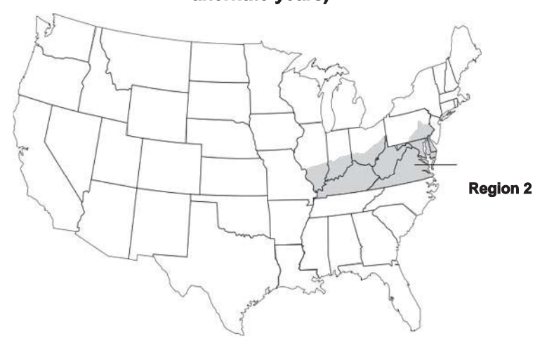
REGION 2 - Includes the following states or portion of states where AX MET-FOME may be applied: Delaware, Kentucky, Maryland, Virginia, West Virginia, South of Interstate 70 in the following states: Illinois, Indiana and Ohio and all areas South of Interstate 80 to the intersection of U.S. Highway 15 and East of U.S. Highway 15 and U.S. Highway 522 in Pennsylvania.