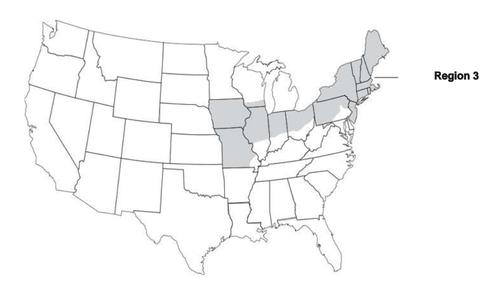
REGION 3 - Includes the following states or portion of states where AX MET-FOME may be applied: Connecticut, Iowa, Maine, Massachusetts, Missouri (all counties except for those listed in Region