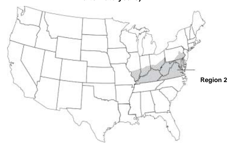
REGION 2 - Includes the following states or portion of states where AX MET-FOME may be applied: Delaware, Kentucky, Maryland, Virginia, West Virginia, South of Interstate 70 in the following states: Illinois, Indiana and Ohio and all areas South of Interstate 80 to the intersection of U.S. Highway 15 and East of U.S. Highway 15 and U.S. Highway 522 in Pennsylvania.