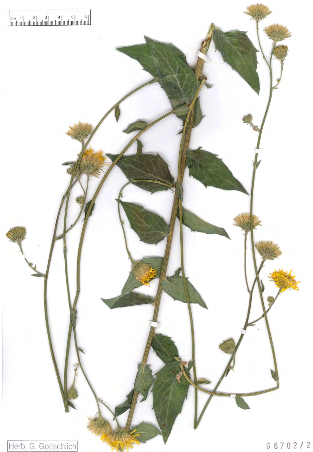
Fig. 4b: Hieracium sabaudolypticum GOTTSCHL. & DUNKEL, middle part of the stem.