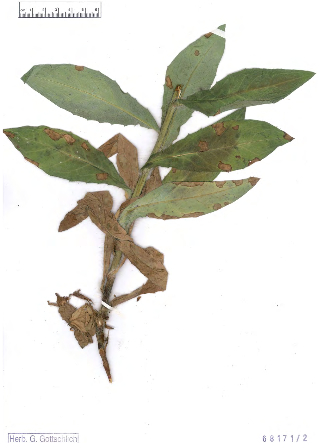
Fig. 9b: Hieracium racolympicum subsp. lycopifoliopsis GOTTSCHL. & DUNKEL, lower part of the stem.