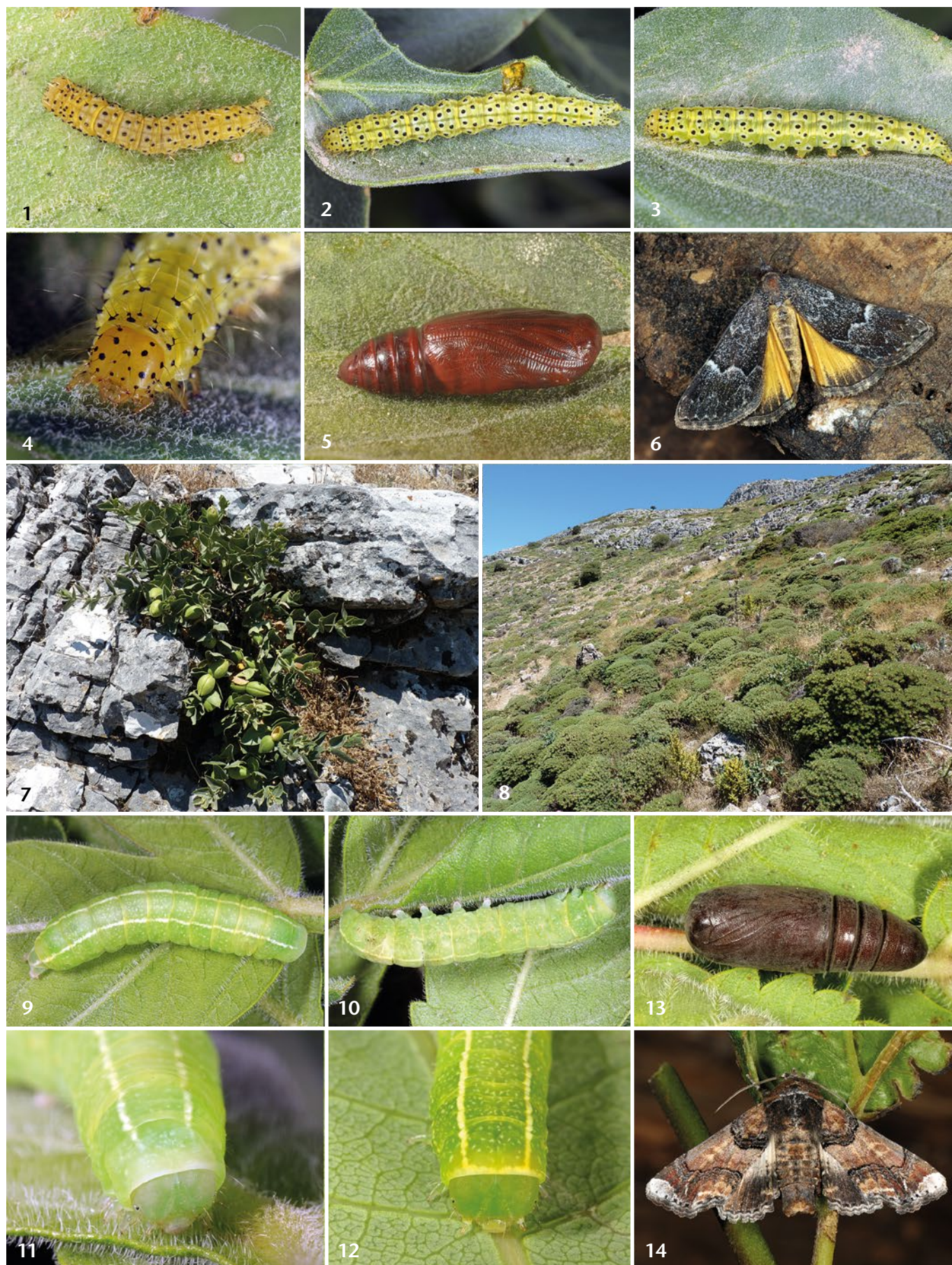
Figs. 1–8: Hypena munitalis , Samos, Mount Kerkis, 900–1250 m, larvae 29. vi. 2016. — Fig. 1: Half-grown larva. Fig. 2: Fully-grown larva, dorsal view. Fig. 3: Fully-grown larva, lateral view. Fig. 4: Fully-grown larva, head. Fig. 5: Pupa, e.l. rearing, cocoon removed. Fig. 6: Imago, e.l. rearing. Fig. 7: Larval habitat: rocky pasture with Vincetoxicum canescens . Fig. 8: Larval habitat: Astragalus -rich mountain slopes with much Vincetoxicum . — Figs. 9–11, 13–15: Eutelia adoratrix , Samos, Vourliotes, 360 m, larva 30. vi. 2016. — Fig. 9: Fully-grown larva, dorsal view. Fig. 10: Fully-grown larva, lateral view. Fig. 11: Fully-grown larva, head and prothoracic shield. — Fig. 12: Eutelia adalatrix : head and prothoracic shield for comparison (larva Greece, Mount Olympus, late vii. 2012). — Fig. 13: Eutelia adoratrix , pupa, e.l. rearing, cocoon removed. Fig. 14: Imago, e.l. rearing.