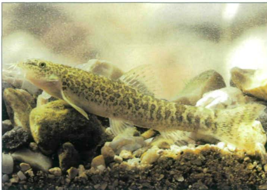
Fig. 6: Nemacheilus insignis from Mujib River.

Dorsal fin extending over much of body length. Dorsal fin rays usually over 30 without a leading spine. Dorsal fin discontinuous or united to caudal fin. Wide gill openings. Barbels 4 pairs. Airbreathing is accomplished with a labyrinthic organ arising from