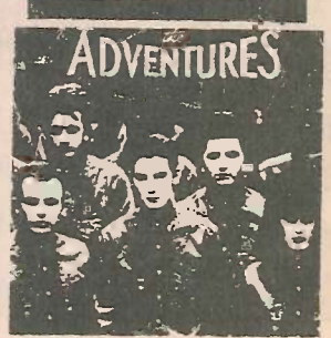
THE ADVENTURES The Adventures Chrysalis - CHS-41488-J