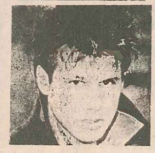
COREY HART Boy In The Box Aquarius - AQ-539-F