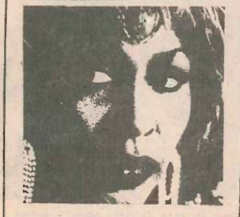
DON'T NEED ANOTHER HERO Tina Turner Capitol - 5491-F