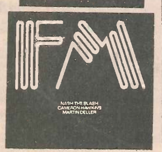
JUST LIKE YOU FM Quality - Q-2463-M