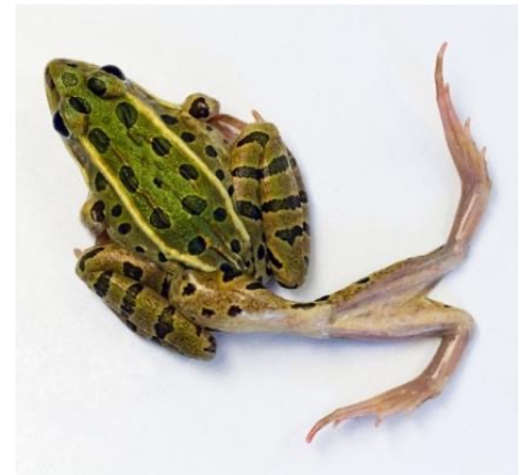
A northern leopard frog from a malformation hotspot in Minnesota.

Over the past two decades, increasing observations of frogs with severe deformities, including extra limbs, missing limbs, and misshapen limbs, have garnered widespread attention and concern. This phenomenon predominantly affects the hind legs of tadpoles and young, recently metamorphosed frogs, in part because deformed animals do not survive into adulthood. While a small fraction of individuals are likely to be abnormal in any population (typically <2%), recent cases often affect 10% or more of emerging frogs, and up to 80% of all frogs. Because of their reduced capacity to feed, jump, swim, and avoid predators, deformed frogs can face additional mortality risks. Within the United States, most observations of deformities – which have been detected in dozens of amphibian species, including those known to be threatened or endangered – are reported in the western, midwestern, and northeastern regions of the US. It is not known whether deformities have increased among amphibian populations, their geographic range, across a larger geographic range, or within individuals.