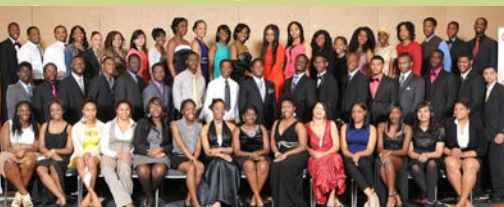
ULP awarded $121,000 in college scholarship funds to 66 Community Scholars at the Empowerment Gala and Scholarship Awards Dinner.

Through our Community Scholarship Program we awarded $121,000 in scholarship funds to 66 students. This year we expanded the program by offering financial literacy workshops to the awardees.