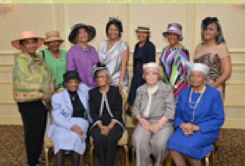
Members of the Urban League of Philadelphia Guild at their Annual Luncheon.

NExT Philadelphia , ULP's young professional group, has grown to 160 members. NExT has developed a relationship with the Russell Byers Charter School. On Earth Day NExT volunteers worked with the students to conduct a science experiment to promote STEM (Science, Technology, Engineering and Math) education.