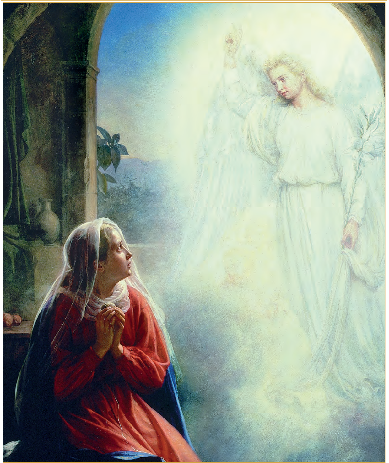
[ CARL BLOCH — The Annunciation ]