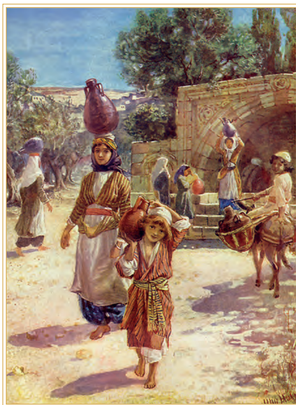
[ WILLIAM HOLE — Jesus as a Boy in Nazareth ]

The most valuable part of Jesus' early education was secured from his parents in answer to his thoughtful and searching inquiries. Joseph never failed to do his full duty in taking pains and spending time answering the boy's