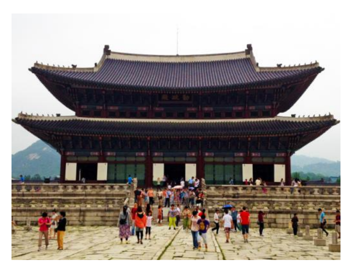
Gyeongbokgung(경복궁), a royal palace, northern Seoul, South Korea

After that meeting, the translators present talked about working cooperatively towards one excellent Korean translation. We have a lot of work to do to achieve that goal, and there is no guarantee of success. But the spirit of cooperation is evident, and we shall build on that.