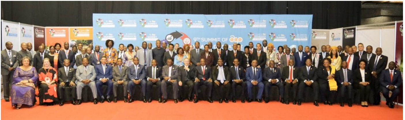
ACP Heads of States, representatives and delegations. Nairobi, Dec 2019

On 6-10 December 2019 in Nairobi – Kenya, Heads of State of the African, Caribbean and Pacific (ACP) Group of States met to consider the key developmental challenges faced by the six ACP regions. The 9 th ACP Summit of Heads of State and Government, themed “A Transformed ACP Committed to Multilateralism” charted a course for greater sustainability and economic self-sufficiency. Organized every three years, it provides ACP leaders from the 79-Member States an opportunity to review major developments of interest and concern on the international scene in general, and in ACP States in particular.