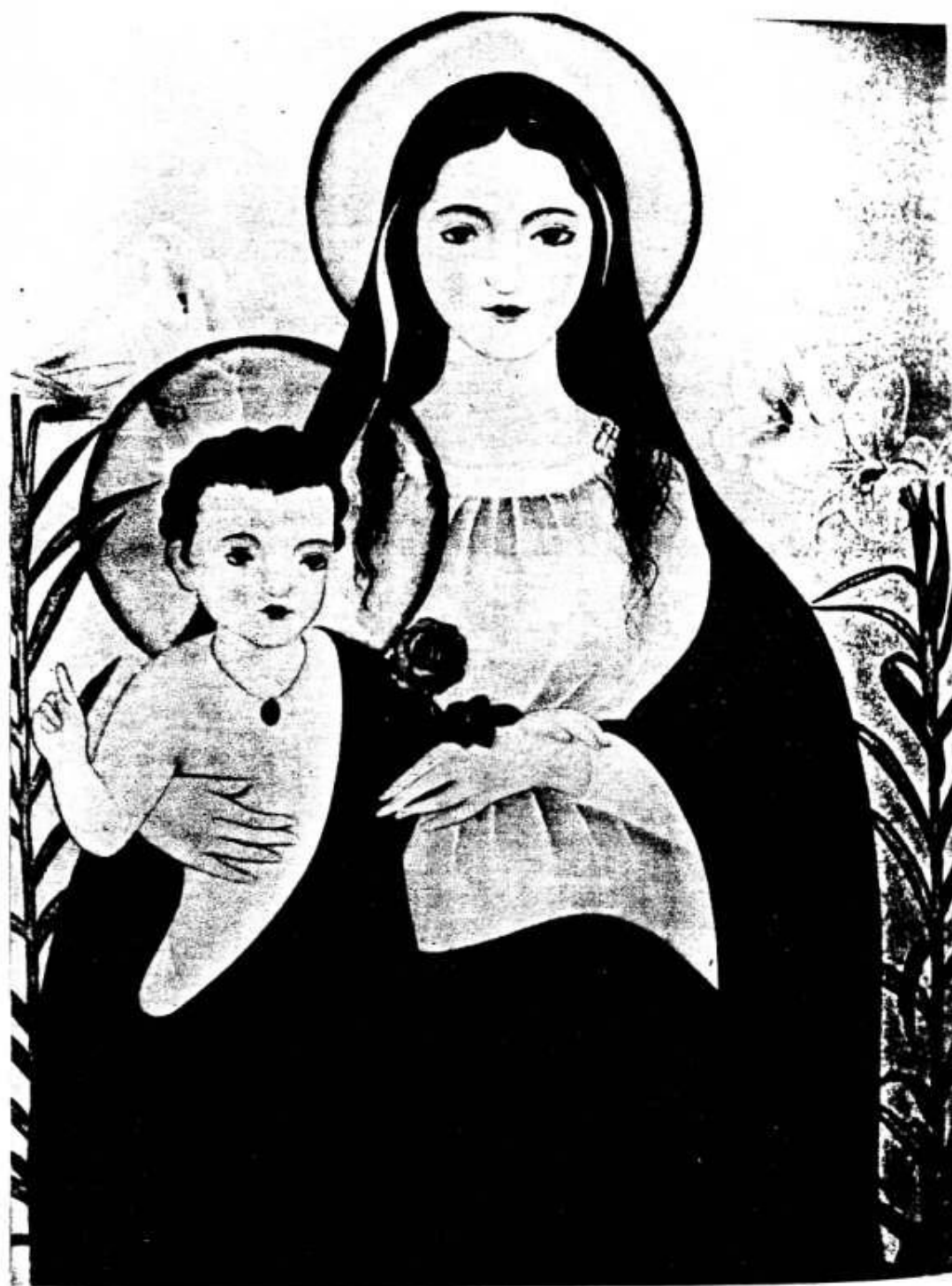
THE MADONNA OF THE ROSE—OKAYAMA