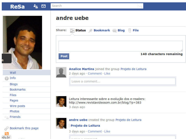
Figure 3 – ReSa Member Menu

The screenshot in Figure 3 shows a list of the personal features described above: