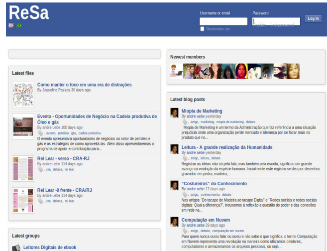
Figure 2 – ReSa Welcome Page

The following picture shows the ReSa welcome page: