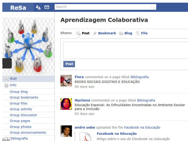
Figure 4 – ReSa Group Menu

Figure 4 shows the Community (Group) features: