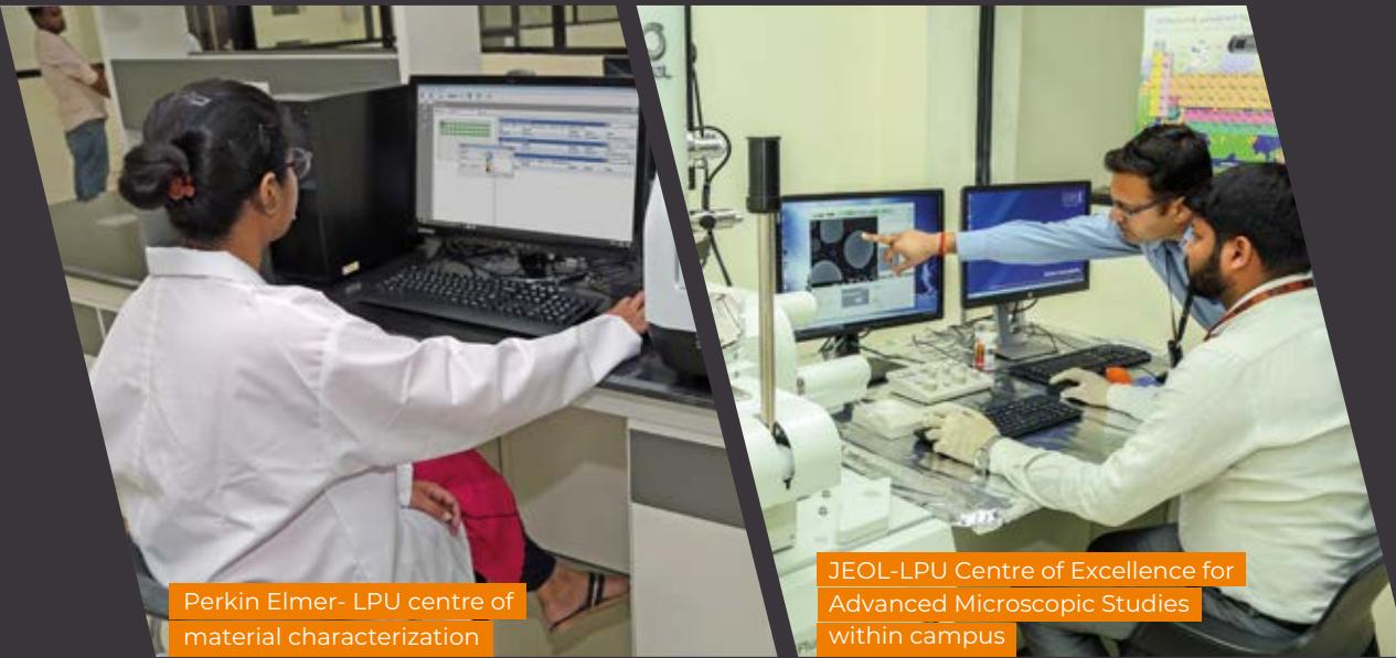
Perkin Elmer- LPU centre of material characterization