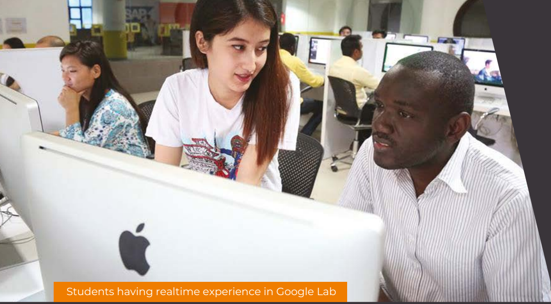
Students having realtime experience in Google Lab