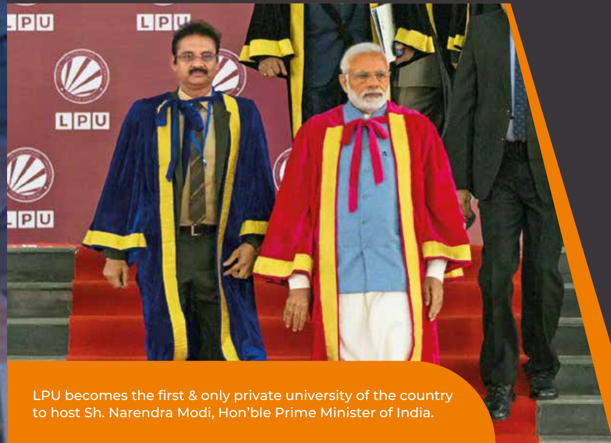
LPU becomes the first & only private university of the country to host Sh. Narendra Modi, Hon'ble Prime Minister of India.

*In terms of number of students on a single campus