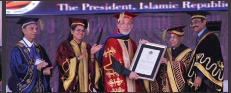
Shri Pranab Mukherjee, Hon'ble President of India, conferring Doctor of Letters (D.Litt) Honoris Causa Degree on His Excellency, Mr. Hamid Karzai, then President of Islamic Republic of Afghanistan