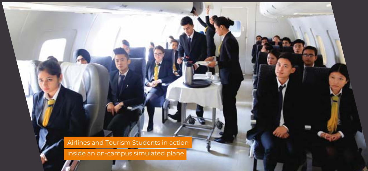
Airlines and Tourism Students in action inside an on-campus simulated plane