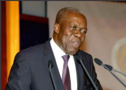
His Excellency Late Mr Kwesi Amissah-Arthur, then Vice President of Republic of Ghana at LPU