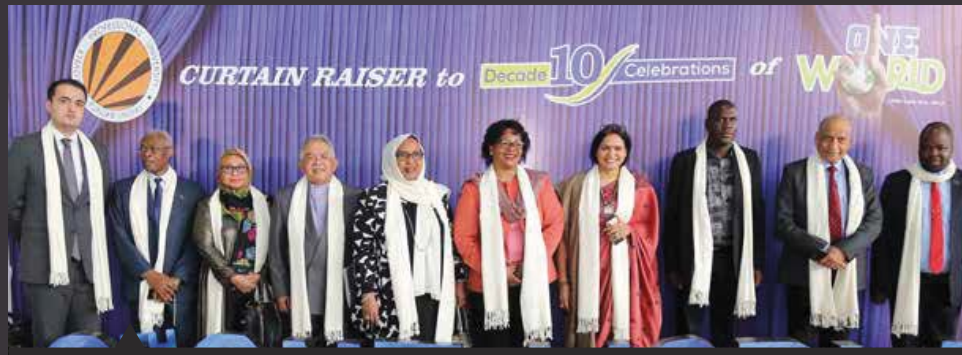
9 Ambassadors and Diplomats from 6 Nations graced the 10th edition of LPU's international mega fest 'ONE WORLD 2019'