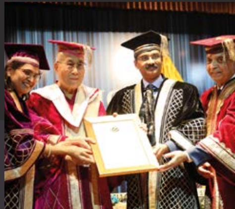
Honoris Causa on His Holiness Dalai Lama on the occasion of 5th Convocation at LPU