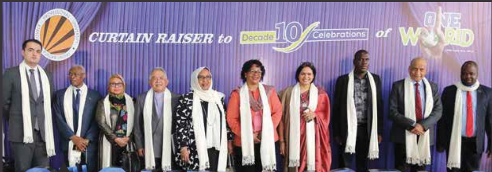
9 Ambassadors and Diplomats from 6 Nations graced the 10th edition of LPU's international mega fest 'ONE WORLD 2019'