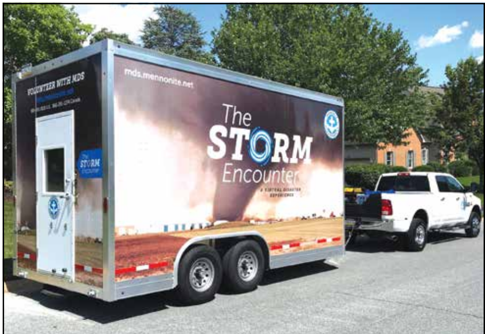
The mobile trailer is a portable movie theater that uses special effects to simulate a catastrophic storm and its aftermath.

"This is an important project," King said. "The number of major disasters has dramatically increased and the need for assistance is growing."