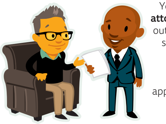
You and your attorney figure out next steps, such as legal paperwork, a trial or follow-up appointments.

You consult with one of the doctors in the network in the office or over the phone.