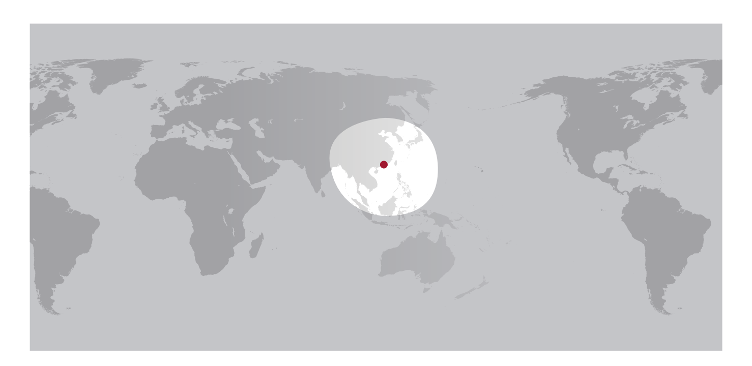
FROM HONG KONG