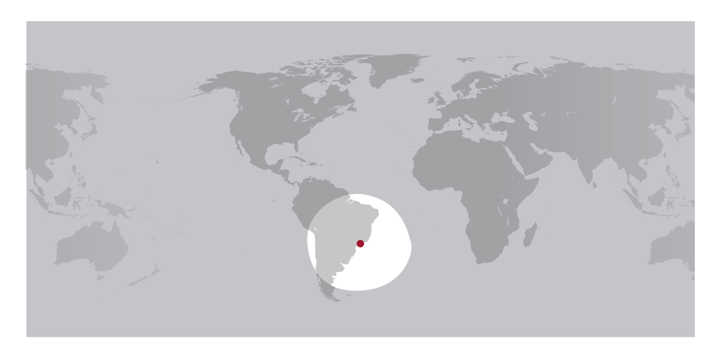
FROM SÃO PAULO