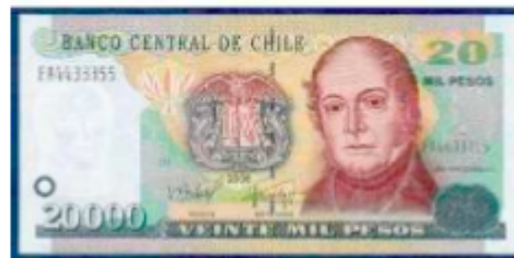
$20,000 pesos, equivalent to $40 US