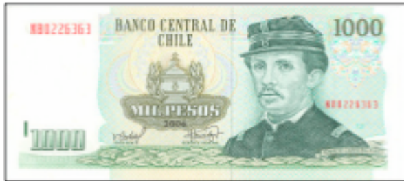
$1,000 pesos, equivalent to $2 US