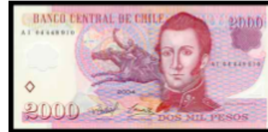
$2,000 pesos, equivalent to $4 US