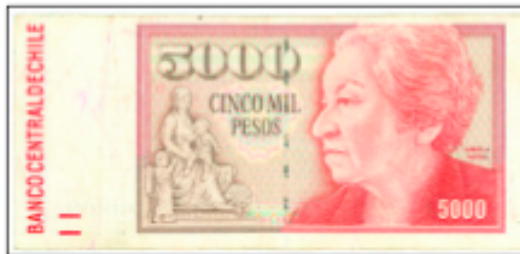
$5,000 pesos, equivalent to $10 US