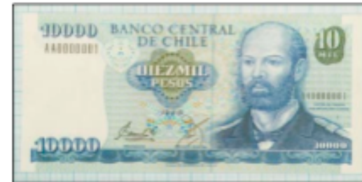
$10,000 pesos, equivalent to $20 US