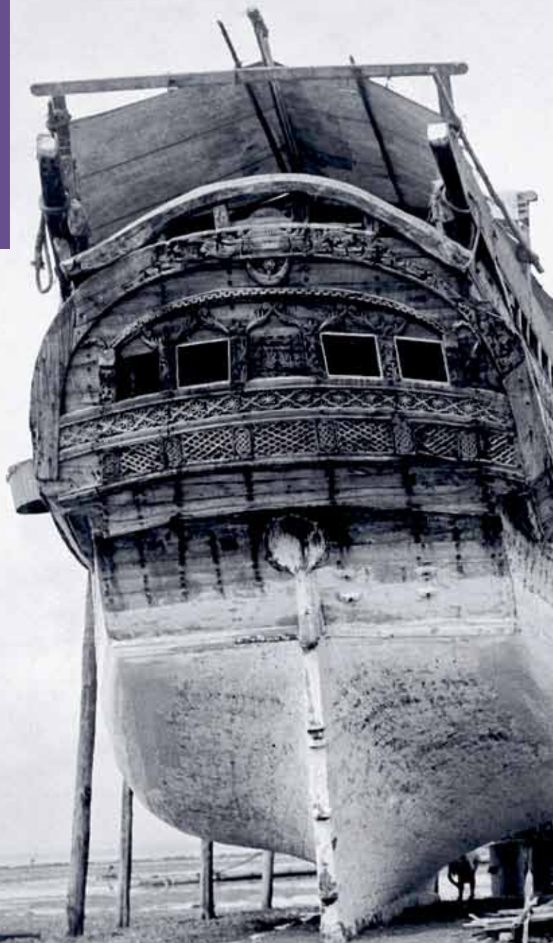
A deep-sea trading dhow known as a baggala undergoing hull maintenance at Kwale Island off the coast of Tanganyika (Tanzania) from the exhibition Sons of Sindbad – the photographs of Alan Villiers , showing the work of this Australian-born maritime writer and photographer.