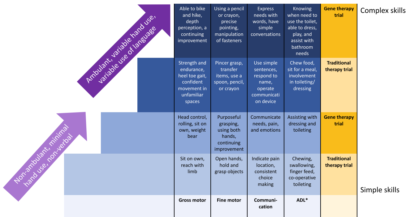
Fig. 1 Summary of important meaningful changes for children with different levels of impairments and the two clinical trial scenarios. *ADL Activities of daily living. ^1 family did not have a meaning-

ful gross motor change for traditional therapy trials and 2 families did not have a meaningful gross motor change for a gene therapy trial, because their child was confidently ambulant