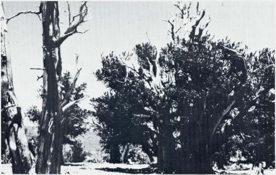
Pinus longaeva —Not the oldest but the largest—37 feet in girth—Age over 1500 years.