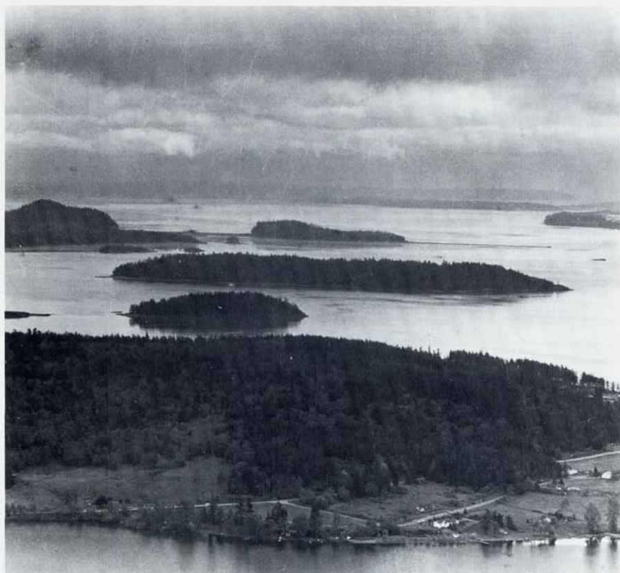
View from Mt. Erie, Wash. in the general direction of Victoria

The San Juan Islands grace the north Puget Sound. They are easily approached from Anacortes, Bellingham and Blaine in the state of Washington, and from Vancouver or Victoria of British Columbia. The San Juans claim attention on several counts. Geologically, they are the “. . . deeply eroded and partially drowned southeastern extension of Vancouver Island” 1 ; as scenery they are enchanting rocky and vegetation-adorned masses set in a network of channels and bays; economically they are a constant temptation to commercial interests; and botanically they nurture an abundance of species and support a treasury of natural rock gardens. We spent half of a delightfully rainy day—May 11, 1974—on Fidalgo, the island nearest the Wash-