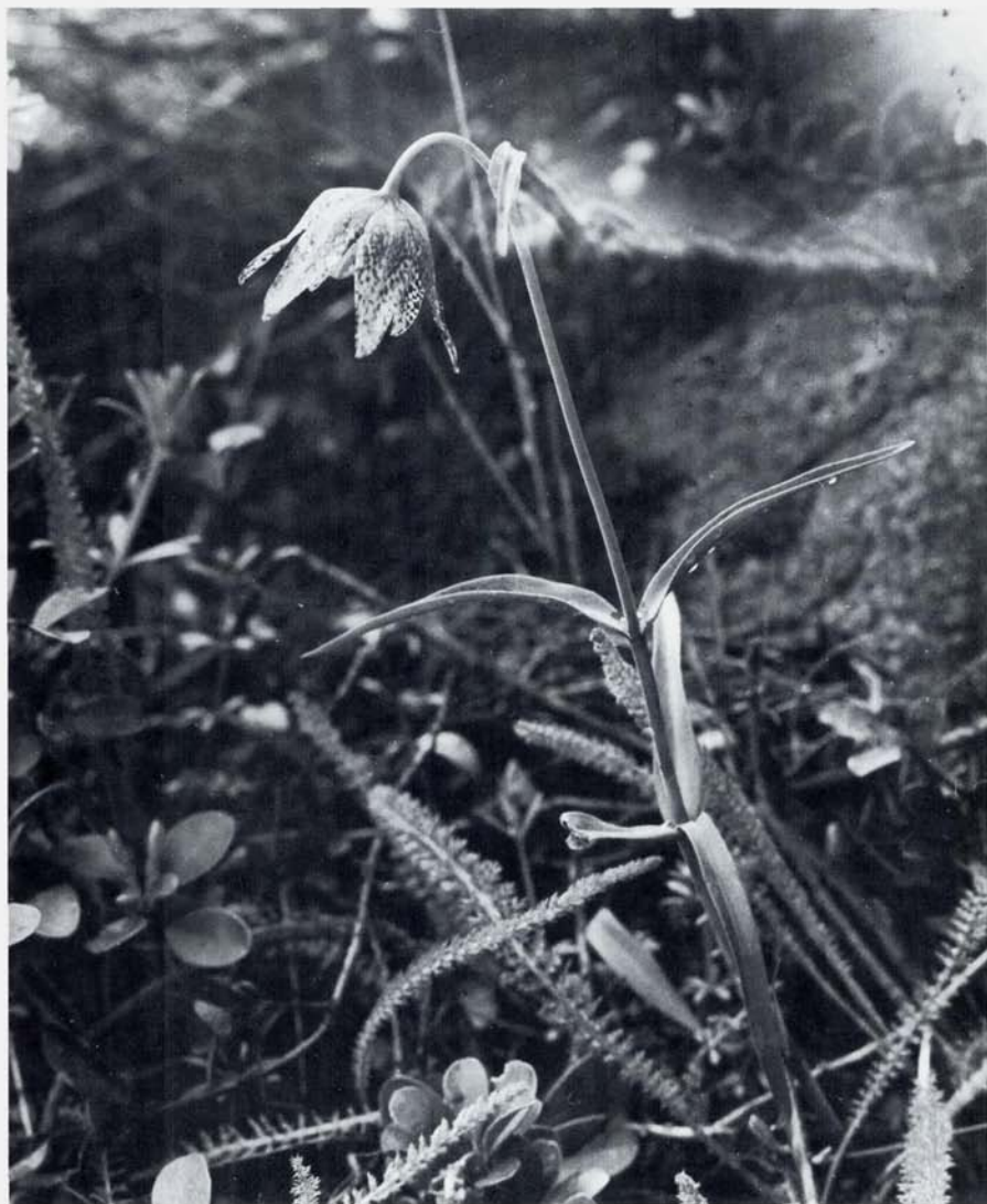
Fritillaria lanceolata at the top of Mt. Erie