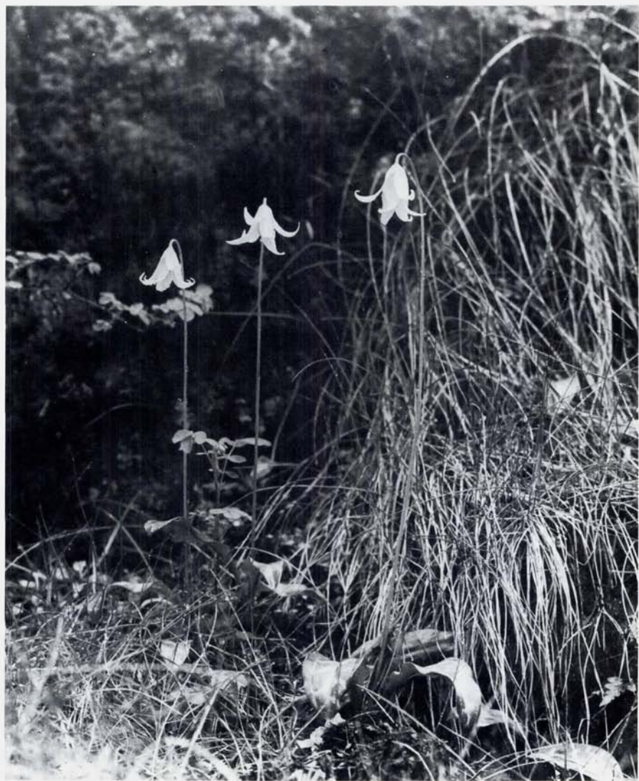
Erythronium oregonum clinging to a narrow ledge at the summit of Mr. Erie (1320 ft.)