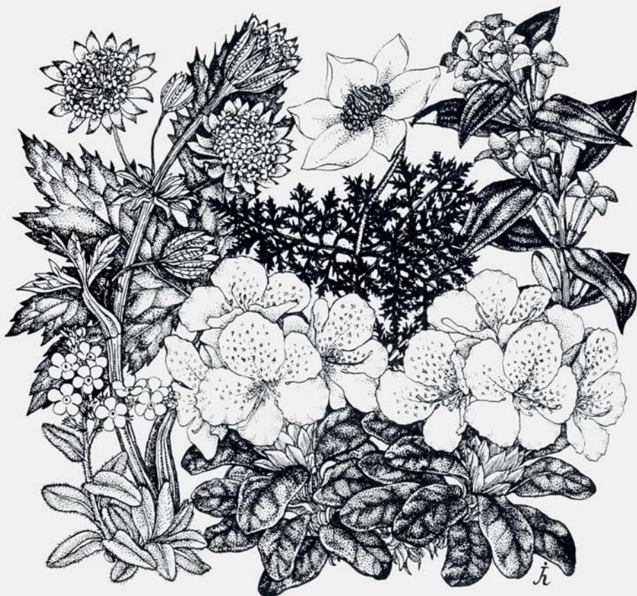
Astrantia helleborifolia Pulsatilla aurea Myosotis alpestris