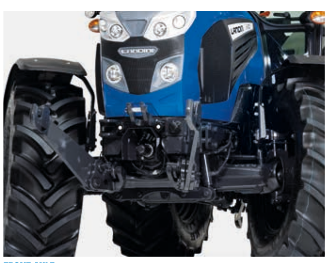
FRONT AXLE. The suspended axle is available as an option.