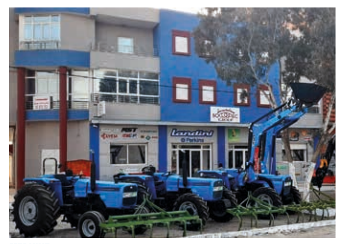
MEDNINE. The new branch opened by Socoopec.

50% of the market for Landini brand alone. The experience, the professionalism and the great availability of Socoopec represent the strengths that have allowed the importer to grow despite the difficulties of the market.