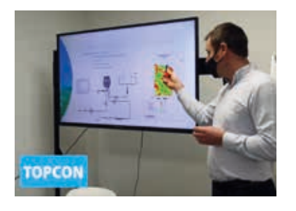
ARGO FRANCE. The intervention of one of the partners.

leasing and classic credit offers. Finally, a marketing training activity was proposed on the various digital tools made available by Argo 4.0 programme, including the Digital Library . This is an online communication support that brings together the photos, brochures and advertising campaigns of Landini tractors, also giving the possibility to customise some documents online.