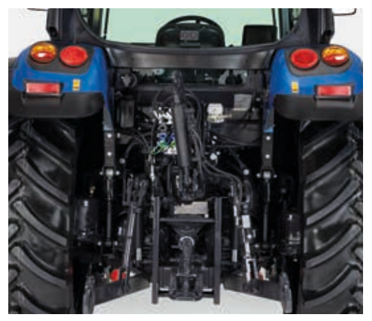
POWER TAKE-OFF. 4 available speeds.

This system makes the Landini 5 Series compatible with the requirements of "Industry 4.0" protocol, thus allowing access to the economic incentives provided by the 4.0 tax credit.