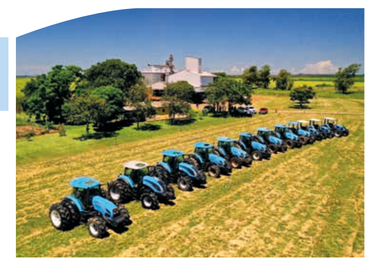
CRUZEIRO DO SUL. Karsburg's Landini fleet.

The large territorial extension of Brazil, with different agricultural vocations - fruit, coffee, milk, cereals and meat - stimulates the demand for the entire range of Landini tractors, from the specialist 2 Series and Rex tractors to the Brutus and Powerfarm open field tractors and the medium tractors with Landforce up to the powerful Landpower and 7 Series.