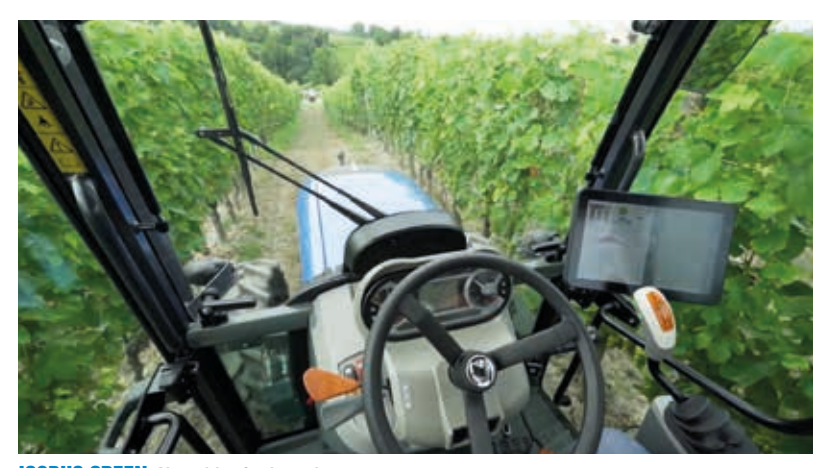
ISOBUS GREEN. No cables in the cab.

SObus Green is the new solution that makes it possible to connect a tractor to implements that are not prepared for electrification, thus effectively and fully transforming mechanical implements into ISObus implements.