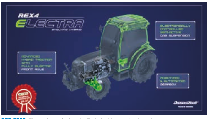
EDP 2020. The project winning the Technical Innovation Award.

For Argo Tractors, the award is a recognition of the great commitment to research and development that allows the brand's tractors to reach the highest levels of technological development.