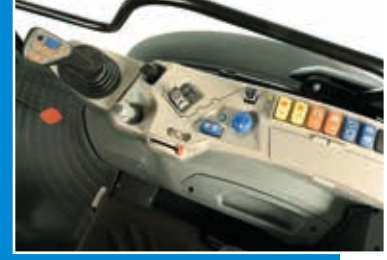
REX4 ELECTRA. The technological innovations introduced by the hybrid system.

But above all, Eima Digital Preview represented for Landini the achievement of a new Technical Innovation award, assigned to the Electra - Evolving Hybrid system of Landini Rex4, being also a protagonist at Eima.