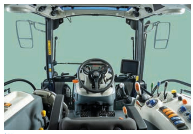
CAB. Panoramic visibility and maximum comfort.