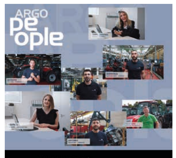
ARGOPEOPLE INVENTA LO SLOGAN

The contest has involved the formation of as many as 30 mixed teams, made up of colleagues from the various company plants, who have to create a slogan capable of conveying the values represented by the employees who live and