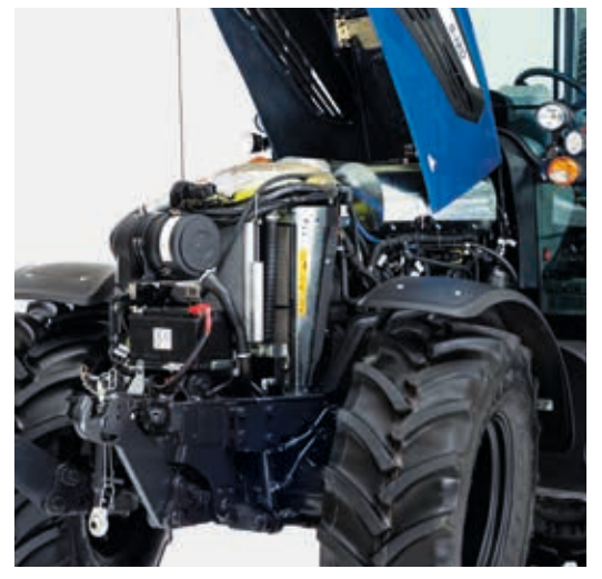
ENGINE. The new FPT Stage V.

The versatility of the 5 Series takes another step forward also thanks to the new hydraulic circuit for increased productivity. It has a flow rate of up to 82 l/min for services and 32 for steering, as well as 35 litres of oil for other functions such as dump trailers. There are 6 hydraulic spool valves available: 3 mechanically controlled , 1 electric and, in option 2 ventral for the front hitch and the front loader that can be combined with each other.