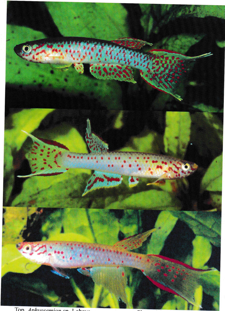
Top. Aphyosemion sp. Lobaye