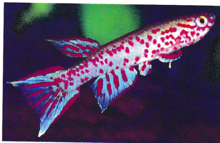
Aphyosemion lamberti

That population showed both the Boendé type of colour pattern (wide dark red band at the dorsal fin: elegans in Lambert's sense) and the cognatum type as well (a light tip at dorsal fin but no dark red broad submargin). They were bred for several generations and both types were maintained during that period but apparently no crossing experiments were undertaken. This is confirmed by a recent aquarium import (Tirbak, per. comm. 2004) said to originate from Maindombe which shows, on photos, a " cognatum like" pattern in the dorsal fin of male and a fasciated pattern on sides, within the elegans distribution (in Lambert's sense): this ambiguity can only be levied by using the male pattern on sides and not the male pattern on dorsal fin, as the primary criterion to separate cognatum and elegans (in Lambert's sense); anyhow, clearly, populations of cognatum from the typical region are well differentiated and genetically defined.