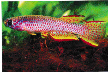
A. schioetzi Ngombi Z91/1

range of schioetzi , starts the distribution of the components of the ogoense superspecies, e.g. A. pyrophore and ottogartneri ).