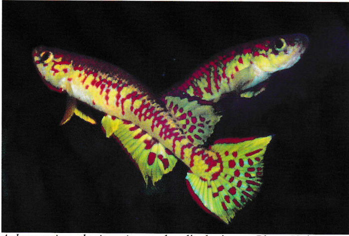
Aphyosemion plagitaenium males displaying