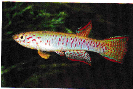
Aphyosemion cognatum

Systematic remarks: this taxon is well defined and known by half a dozen populations in the forested plateau of Congo. It is replaced by schioetzi southerly and by elegans (in Lambert's case) northerly and easterly. Hence it can be hypothesized that the rest of its distribution lies westerly in Congo and maybe Gabon, up to that of lamberti .