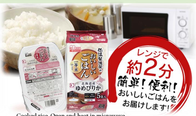
Cooked rice. Open and heat in microwave. Ready to eat in 2 minutes.