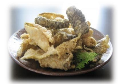
Salmon skin chips