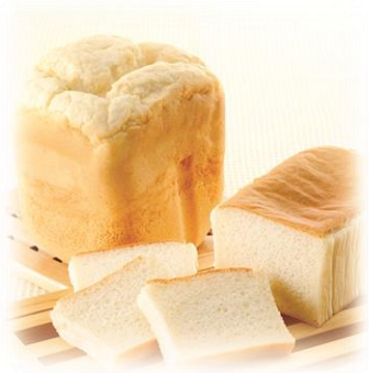
Gluten-free Rice Bread Mix