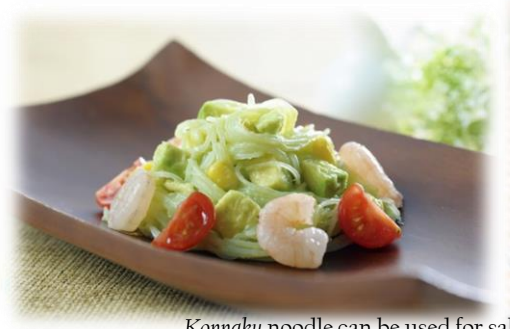
Konnaku noodle can be used for salads and pasta dishes