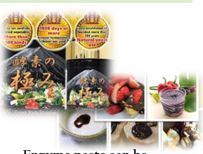
Enzyme paste can be used in various beverages