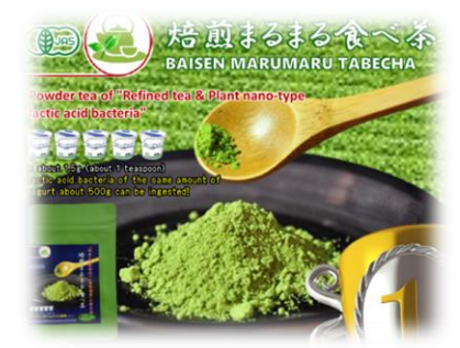
JAS-certified Green-tea powder

Enzyme drink and Enzyme Paste - made using 106 kinds of natural ingredients. Fermented for over 1000 days. Nutrient-rich. No water added.