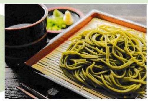
Green-tea infused buckwheat soba noodles