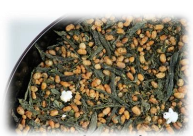
Genmaicha - aroma of roasted organic brown rice, clean finish