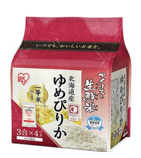
Japanese rice ("Yume Pirika")

"Cold Process Milling" keeps rice as fresh as those just harvested and cleaned in a laminated bag with an oxygen absorber pack. Shelf-life is as long as 12 months.