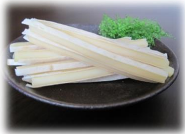
Tokachi Cheese Pollacky

Healthy snacks using Hokkaido's finest ingredients. Creamy Hokkaido Tokachi cheese sandwiched with dried cod, roasted Hokkaido salmon skin packed with collagen, Salmon jerky made from high-quality Hokkaido Salmon.