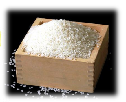
Gluten-free cookies made with Japanese rice flour