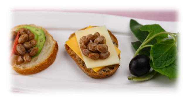
Can be used as a topping for canapés