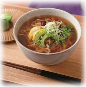
Organic Shoyu Ramen