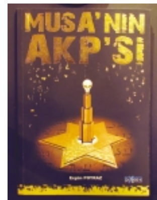
"The AKP of Moses" (i.e., Justice and Development Party, the ruling party of Turkey, controlled by the Jews).