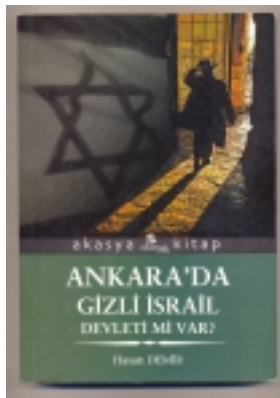
"Is There a Hidden State of Israel in Ankara?"