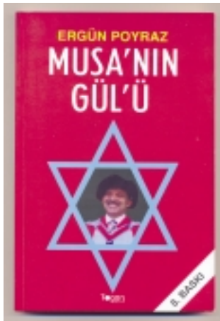
"The Rose of Moses" ("rose" in Turkish being "gül," the title is also a reference to Abdullah Gül, the president of Turkey; it can thus also be read as "Gül of the Jews").