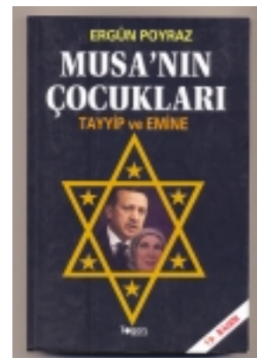
"The Children of Moses – Tayyip and Emine" (referring to the Turkish prime minister, Tayyip Erdoğan, and his wife Emine).

1. http://pqasb.pqarchiver.com/washingtonpost/access/1359111151.html?dids=1359111151:1359111151&FMT=ABS&FMTS=ABS:FT&fmac=&date=Oct+7%2C+2007&author=Mustafa+Akyol&desc=The+Protocols+of+the+Elders+of+Turkey (last retrieved 3 March 2008).