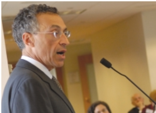
Former U.S. Solicitor General Seth Waxman