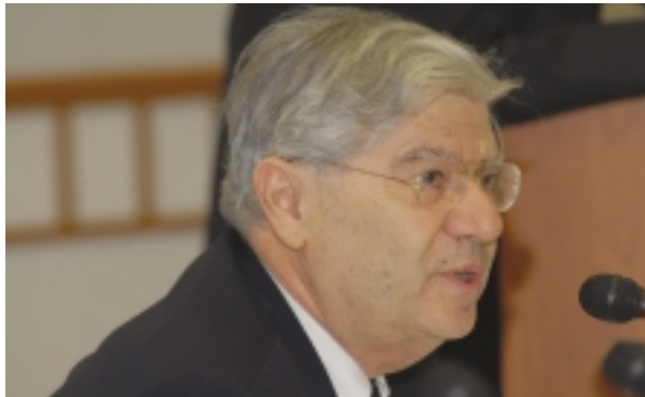
Retired Israeli Supreme Court President Aharon Barak