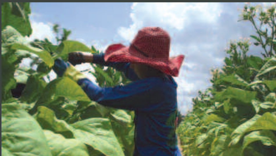
A 15-year-old girl works on a tobacco farm in North Carolina. July 2013.

Human Rights Watch calls on tobacco companies to enact policies to prohibit children from engaging in any tasks that risk their health and safety. Human Rights Watch also calls on the Obama administration and Congress to take action to protect children from the dangers of tobacco farming.