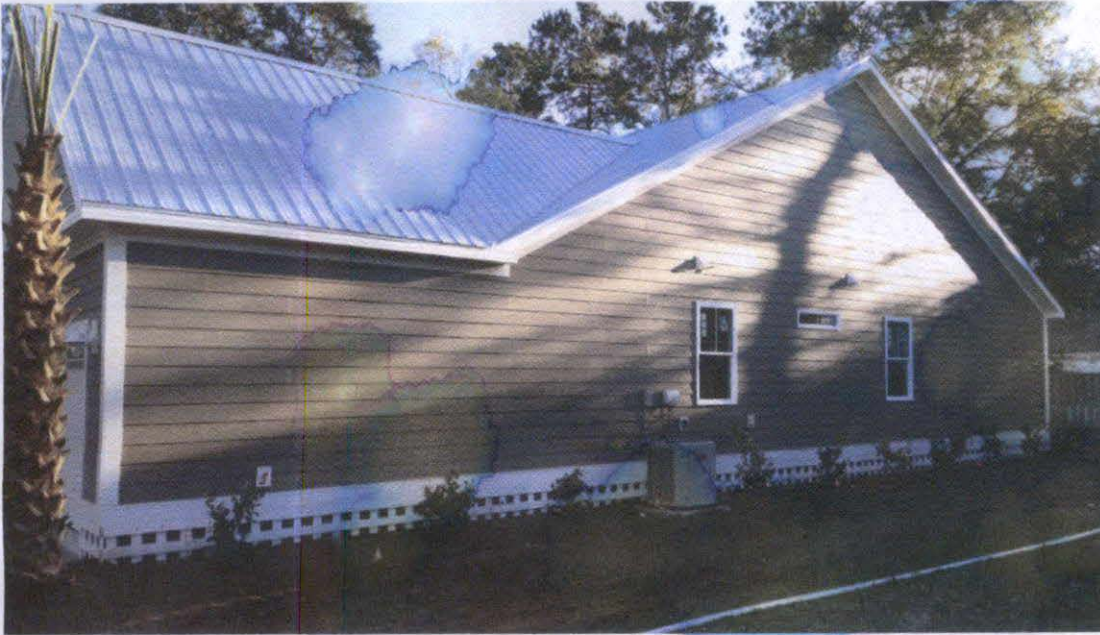
Right / AC 1/12/16

If submitting more photographs than will fit on the preceding page, affix the additional photographs below. Identify all photographs with: date taken; "Front View" and "Rear View"; and, if required, "Right Side View" and "Left Side View." When applicable, photographs must show the foundation with representative examples of the flood openings or vents, as indicated in Section A8.