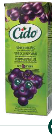
CIDO Grape nectar 50%