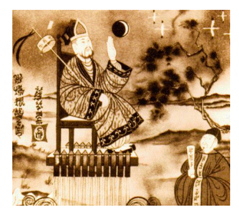
Figure 1: The first Chinese cosmonaut used pyrotechnic rockets for propulsion [1].

Modern propulsion is based on the reactive force movement known since the ancient Chinese civilization during at least 5000 years (Fig. 1).