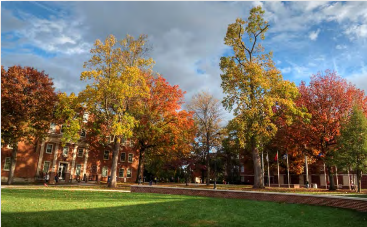
The Quad is beautiful on an early fall day.