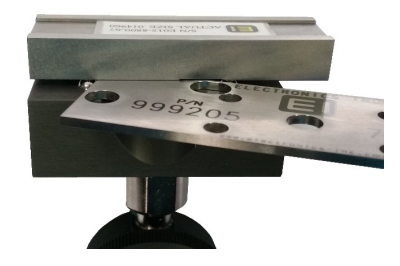
The 9-hole template verifies that the ball heights are at least 2.00 mm in height

This is a pass/fail test. Place a certified flat surface (such as a step block or the flat side of the check block) on the Almen gage head and attempt to insert the 2.0 mm template between the gage head and the flat surface. If the template cannot be inserted, the ball height is less than 2.00 mm and the gage head must be replaced. Record "Pass" or "Fail" in the column of the form. Record any notes if necessary.