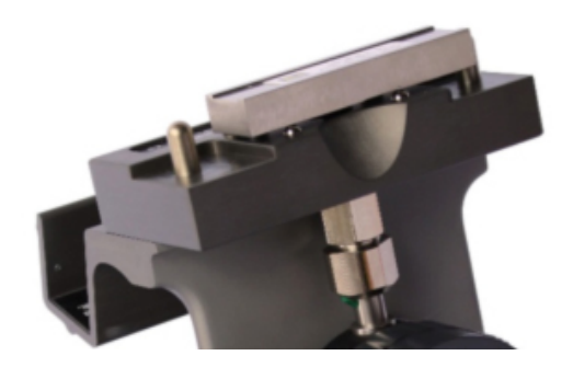
Photograph on left: Place the step block to one side, allowing the indicator tip to touch the flat zero reference surface of the step block. Photograph on right: Slide the step block to the other side to allow the indicator tip to extend into the step.