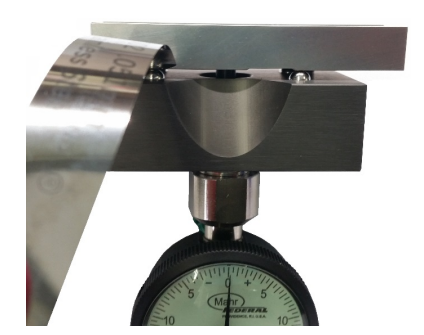
A .002 inch feeler gage verifies that the ball plane flatness is within tolerance

This is a pass/fail test. Place a qualified flat surface, such as a step block or the flat check block, on the gage head to determine if one of the balls is lower than the other three balls. Check if the gap is larger than ±.002 inch by attempting to insert a .002 inch (0.05 mm) feeler gage between any one of the four balls and the flat surface. If the feeler gage can be inserted between any ball and the flat surface while the remaining three balls are in contact with the flat surface, the ball plane flatness exceeds the tolerance and the gage head must be replaced. Record "Pass" or "Fail" in the column of the form. Use the Notes column to record any repairs or replacements.