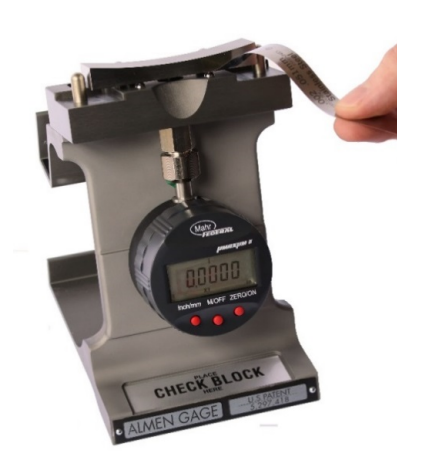
A 0.05 mm feeler gage verifies the ball plane flatness is within tolerance

This is a pass/fail test. Place a certified flat surface, such as the flat side of the curved check block, on the gage head to determine if one of the balls is lower than the other three balls. Check if the gap is larger than 0.05 mm by attempting to insert a 0.05 mm feeler gage between any one of the four balls and the flat surface. If the feeler gage can be inserted between any ball and the flat surface while the remaining three balls are in contact with the flat surface, the ball plane flatness exceeds the tolerance and the gage head must be replaced. Record "Pass" or "Fail" in the column of the form. Record any notes if necessary.