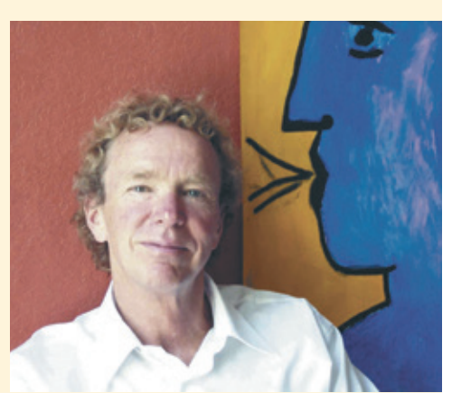
John Gilbreath.

The Earshot Jazz organization began as a single sheet publication, simply called Earshot , late in 1984.