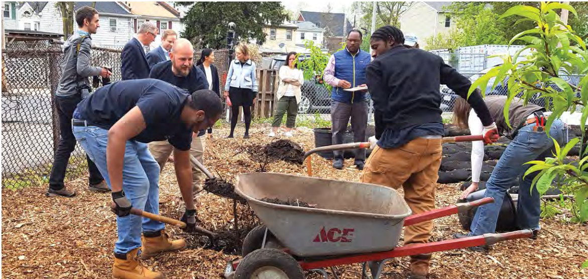
Tree planting, hosted by CSNDC and TNC, in Codman Square's Oasis on Ballou urban agriculture site.

In addition, CSNDC offers well-being and employment resources for people of color: