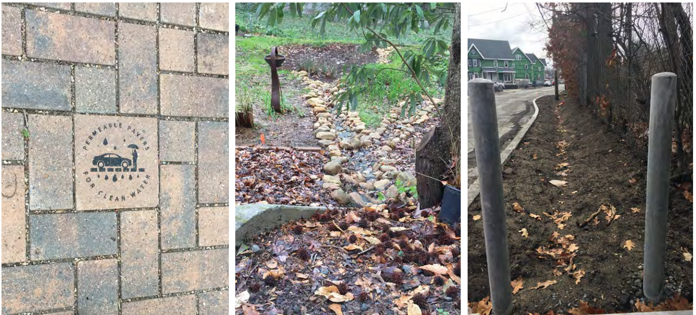
Examples of green infrastructure. (Left) Pervious pavement installation completed by the Mississippi Watershed Management Organization in Minneapolis, MN. (Middle) Rain garden facility completed by HABESHA in Atlanta, GA. (Right) Unplanted bioswale designed to accept and filter water from the adjacent roadway, part of Boston’s Slow Streets Initiative in Codman Square.

Green infrastructure job categories, education, and skillsets. Our discussion will focus on green infrastructure work in the installation, maintenance, and inspection (IMI) phases, each of which requires distinct skillsets [1]. The IMI phases can also be referred to as operations and maintenance work, which has an overlapping set of standard occupational categories [4]. While current research reports on green infrastructure jobs use the broader definition of green infrastructure, two key learnings are likely to apply to the subset of occupations in green stormwater infrastructure.