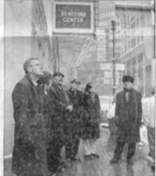
Now, we know: Mayors Inspect Redemptive Sites in the Cultural District.

1 The bulk of Pittsburgh's best practices happened last month, though from seven different cities, broadly made their way into the 2010 Design Institute on City Design, hosted by the Pennsylvania State University and the Pennsylvania State University. The institute was held through the Cultural District and then spent the next two days at the Fox Theater of PNC Park working alongside eight design professionals from around the country. Each major presentation a case study on a project was presented with related to the redevelopment of vacant land, historical preservation or preservation. The projects ranged from historic and industrial reuse on their project. The case studies ranged from the historic neighborhood design to industrial reuse projects to downtown renovation projects. Two themes emerged from the sessions — resilience and reuse for the existing historic, but also for those who come through Pittsburgh. There is hope. Although the cities of the Midwest have lost jobs and manufacturing since the last 20 years as their manufacturing base has declined, they also have great strengths in their historic, cultural, local production, culture and recreational areas, neighborhoods, water parks and reuse of old, industrial and old sites. "We can use 'winning stock' rather than 'losing' it," said one of the speakers, "we can use 'winning stock' rather than 'losing' it." We can use "winning stock" rather than "losing" it. Rather use "winning stock" rather than "losing" it.