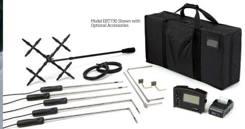
Model EBT730 Shown with Optional Accessories