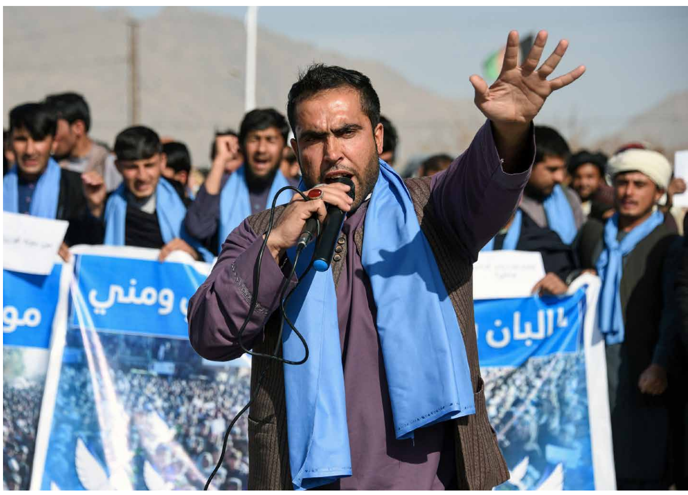
Afghan protesters march for peace and ceasefire as they shout slogans and hold banners in the Kandahar province on January 17, 2019. Several hundred protesters marched in three cities in southern and eastern Afghanistan on January 17 to call for peace and a ceasefire in the 17-year war, the latest action in a movement launched in May 2018. In Kandahar, the southern cradle of the Taliban, and in the eastern cities of Khost and Jalalabad, they marched holding placards saying: "No War", "We want ceasefire" and "We want Peace".