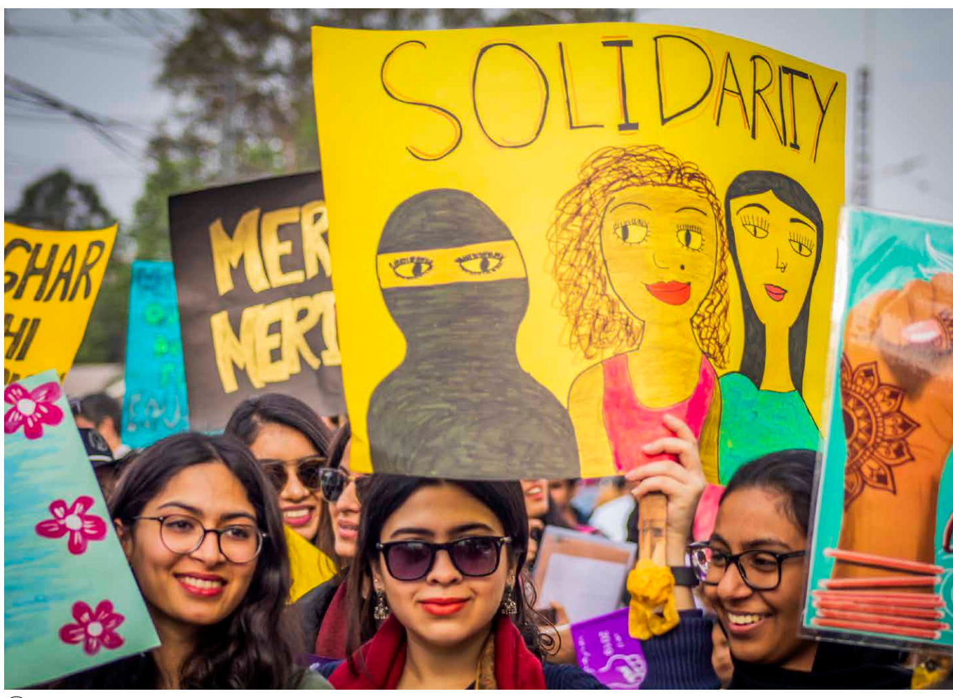
( a ) ↑