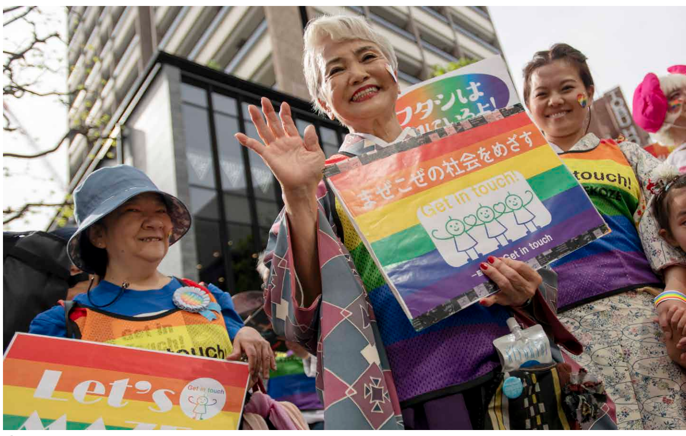
Participants march in the Tokyo Rainbow Pride parade on the streets of Tokyo, Japan, 28 April 2019. People participated in the march, of sexual minorities of the LGBT (lesbian, gay, bisexual, and transgender) community and their supporters paraded through the streets of downtown Tokyo to promote a society free of prejudice and discrimination.