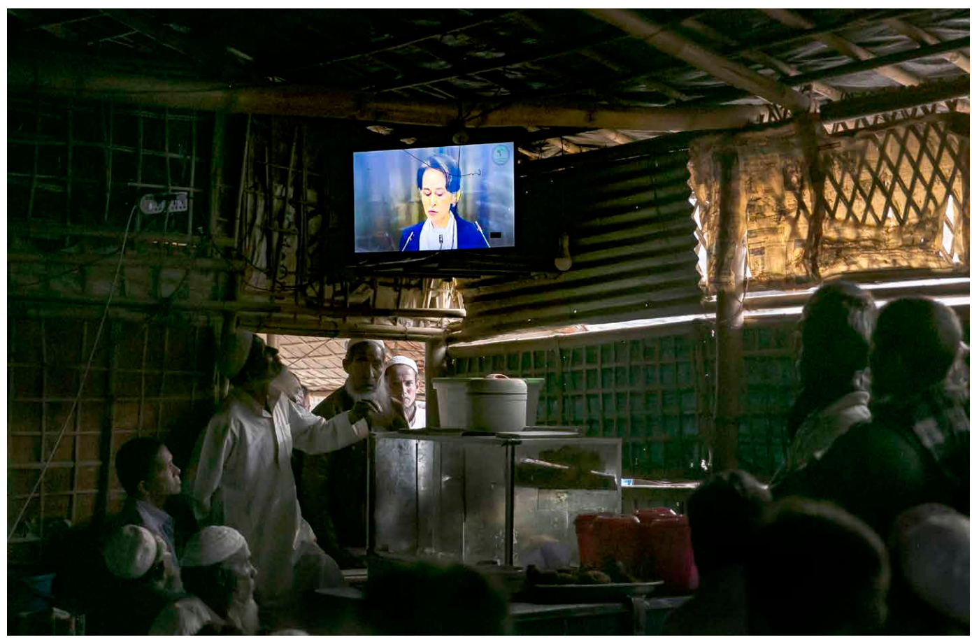
Rohingya refugees in Cox's Bazar, Bangladesh, watch Myanmar political leader Aung San Suu Kyi appear at a hearing in the Royingya genocide case, on 12 December 2019.