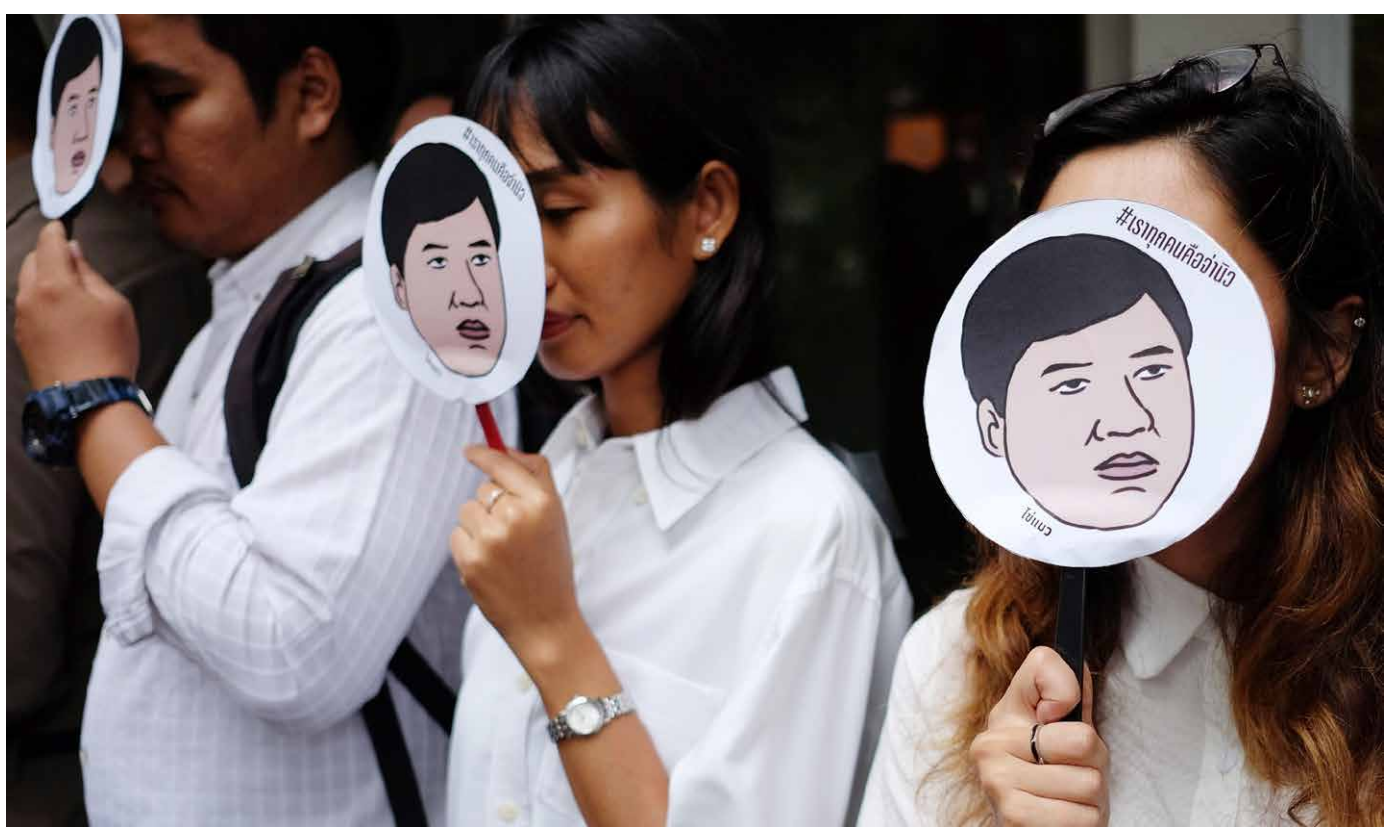
Members of Amnesty International hold up images of Sirawith "Ja New" Seritiwat, who was beaten by unknown assailants, during a protest in Bangkok against the attack on 3 July 2019.