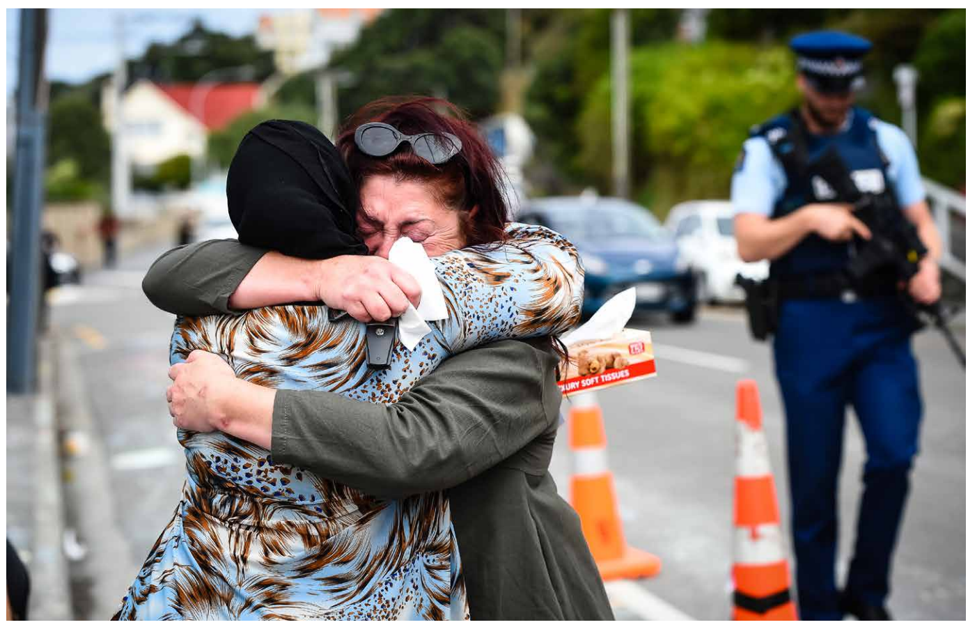
People embrace at the Kilbirnie Mosque in Wellington, New Zealand, on 17 March 2019, in the wake of the shooting attack on two mosques in Christchurch.