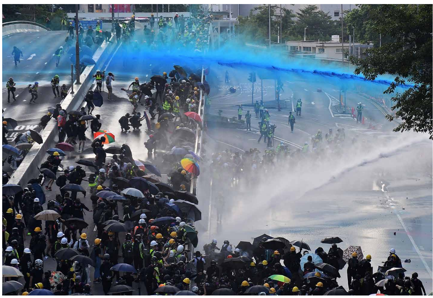
Pro-democracy protesters react as police fire water cannons outside the government headquarters in Hong Kong on September 15, 2019.