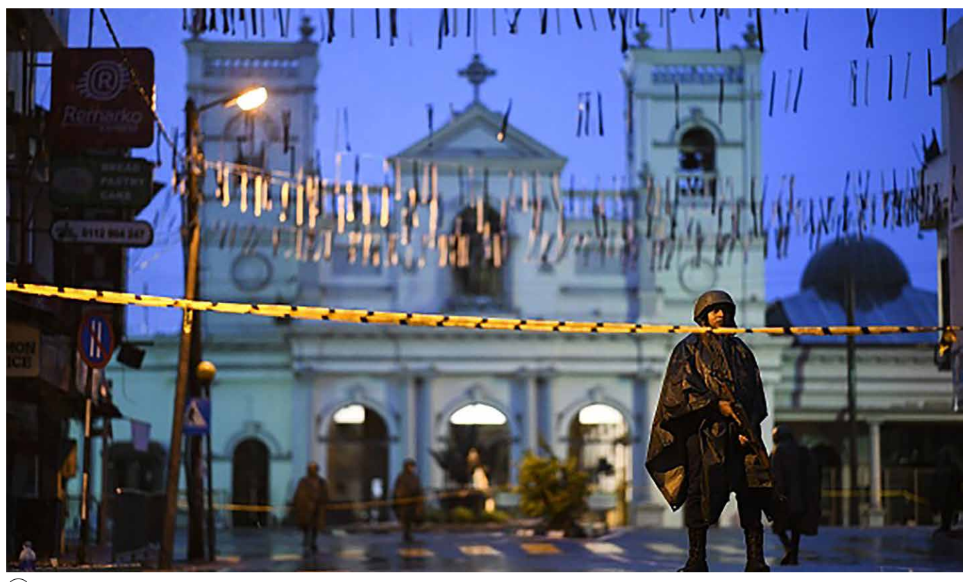
Aftermath of the Easter Sunday Attack - St. Anthony's Church, Kochchikade.