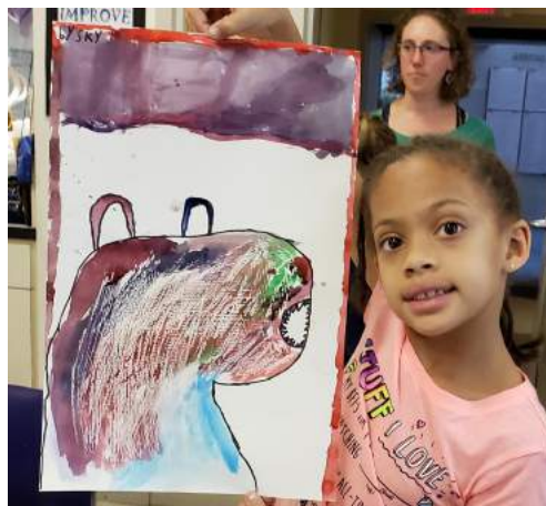
ART-MAKING IN THE STUDIO