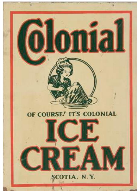
COLONIAL ICE CREAM SCOTIA, NY