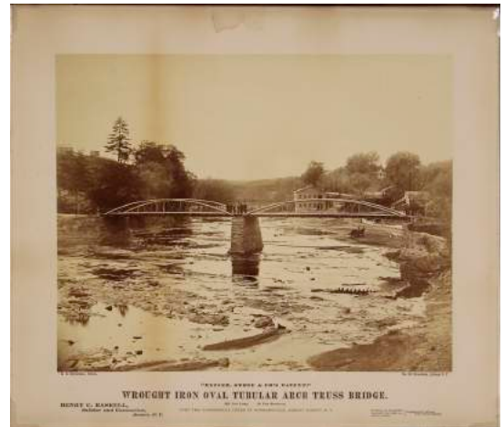
WROUGHT IRON OVAL TUBULAR ARCH TRUSS BRIDGE

Five scrapbooks from the historian of the American Legion (Albany) Fort Orange Post No. 30, mostly dating to 1930-1950's. Gift of Shawn Purcell, LIB 2018.34.1-5