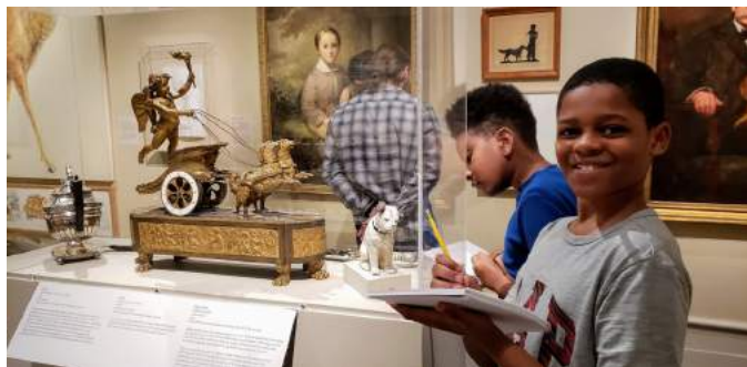
SCHOOL FIELD TRIPS

September was also the start of the school field trip season and through the support of the Review Foundation, Seymour Fox Memorial Foundation, and Bank of America, the cost of admission for student field trips, reimbursement of busing costs, and a free admission pass to each student to return to the museum was covered for area Title I Schools.