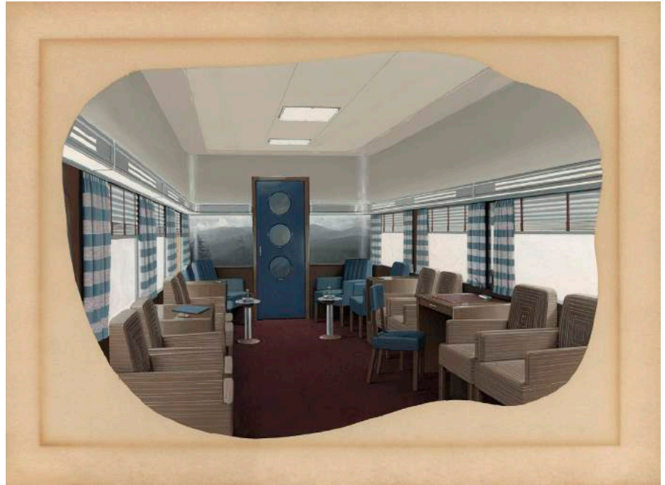
LOUNGE SECTION TOWARD END OF CAR FOR THE NEW YORK CENTRAL RAILROAD EMPIRE STATE EXPRESS