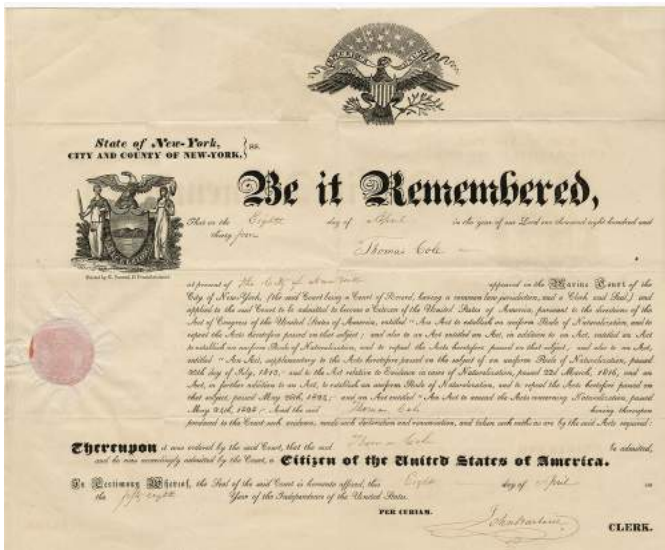
THOMAS COLE'S NATURALIZATION DOCUMENT

JANUARY was the official start of the “Year of Thomas Cole” where museums collectively recognized Thomas Cole’s contribution to American Art and the significance of the Hudson River School with special exhibitions. The Albany Institute lent three collection items to the Metropolitan Museum of Art’s exhibition Thomas Cole’s Journey: Atlantic Crossings , which was the inaugural event of this 200th anniversary celebration of Cole’s immigration to the United States. Loans included Cole’s painting of the Interior of the Colosseum, Rome ; his early pencil drawing of a tree, titled “From Nature”; and Cole’s U.S. naturalization document, which is part of the Institute’s manuscript collection.