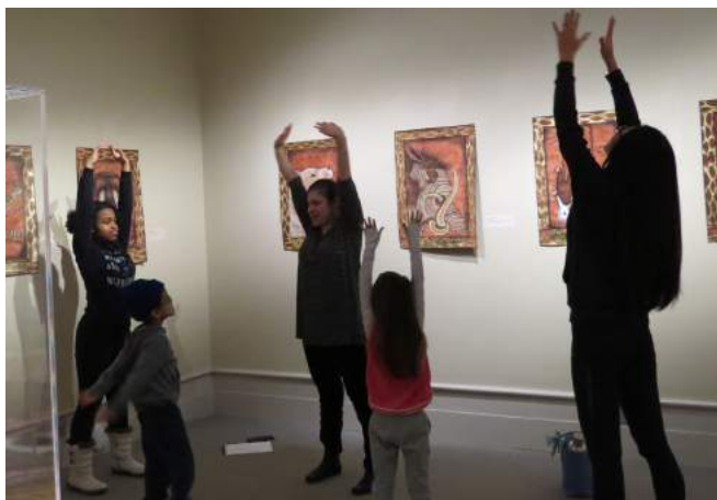
ANIMAL YOGA IN THE GALLERIES