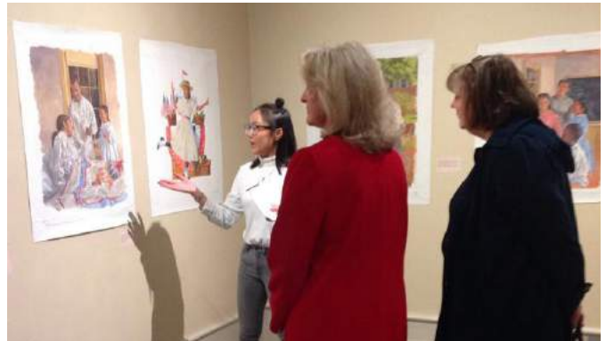
JUNIOR INTERPRETER PROGRAM

The Junior Interpreter program started its second season with an increase in applications and eager participants. The fall free admission days, including federal holidays and the annual Home for the Holidays weekend, drew large crowds ready to see the exhibitions and spend time with family and friends.