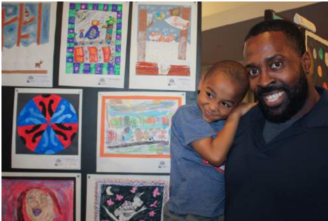
CSDA ELEMENTARY ART SHOW

In May, we welcomed families for the 2018 City School District of Albany Elementary School Art Show , a special weekend celebrating youth art and art education. We also gathered hospitality and heritage partners to talk about tourism efforts related to the Hudson River School and the Year of Thomas Cole, an initiative that was made possible through collaboration and support of Discover Albany.