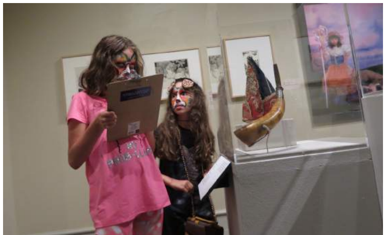
FAMILY FUN DAY AT THE MOO-SEUM