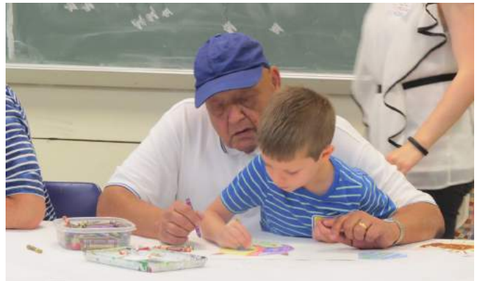
'TUTE FOR TOTS