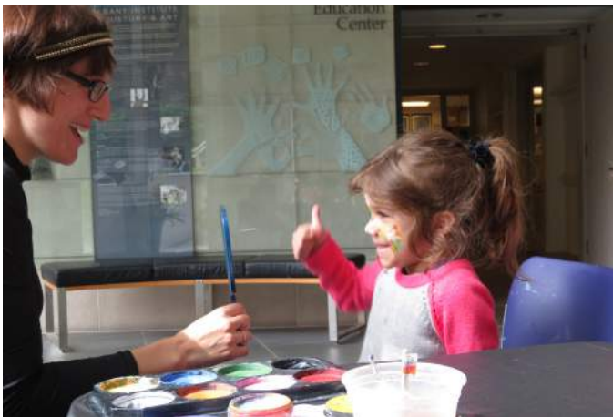
FAMILY FUN DAY AT THE MOO-SEUM

September was filled with family activities and the theme of the season was animals! From story time on Saturday mornings with the Albany Public Library to a very popular Family Fun Day at the Moo-seum, families came ready to have fun and explore animals in books, through crafts, and with art.