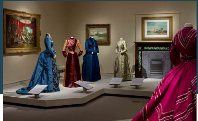
WELL-DRESSED IN VICTORIAN ALBANY

In addition to The Met, the Albany Institute lent Thomas Cole materials to the National Gallery London, the Fenimore Art Museum, and the Thomas Cole National Historic Site. The Institute itself opened the exhibition Thomas Cole's Paper Trail to showcase the museum's rich collection of works on paper by Thomas Cole and explored the celebrated artist's evolution and process.