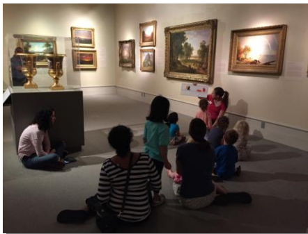
Tute for Tots students and parents in galleries

morning programs engaged 100 children and their accompanying parent/guardian, representing a participation increase of 49% over 2015. Artful Mornings programs offer children the opportunity to create vibrant works of art inspired by our exhibitions and permanent collections. A total of 27 programs offered 3 days each week were attended by 330 children aged 6-12.