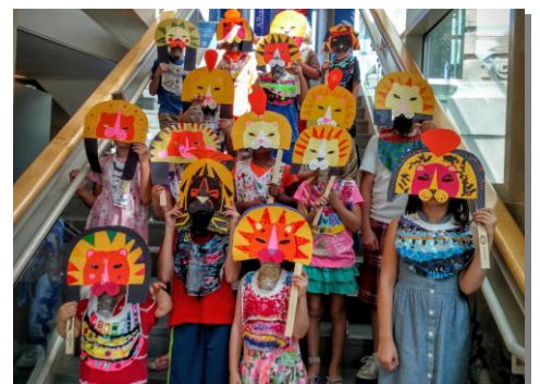
Artful Morning artists show off their Ancient Egyptian inspired masks, broad collars, and Pharaoh's false beards

We designed the Art Connects programs for people affected with early to mid-stage Alzheimer's and other cognitive deficits with their care givers. We use our collections to renew and build social connections and to inspire reflections and conversations. It does not require a background in art, nor does it rely on memory. Art Connects has been through two pilot implementations: the first in 2014-2015 in partnership with regional Alzheimer service organizations; and the second, which was adapted and revised in response to program assessments, was successfully implemented in March and April of 2016. A total of 70 adults participated in the 8 programs offered in 2016.