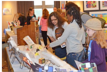
City School District of Albany Elementary Art Show

reproductions and supporting materials that introduce students to the history and culture of the Capital Region of New York through object-based learning. Education Department staff conducted 4 teacher workshops and attended 2 professional conferences distributing over 180 curriculum packets to teachers throughout the Hudson Valley and New York State in 2016. The lesson plans are available on our website and can be used with any classroom technology in conjunction with the online exhibition.