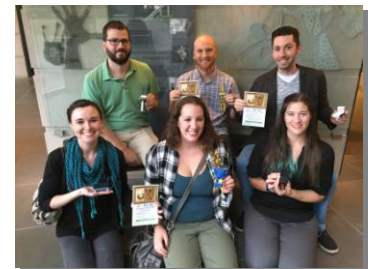
Art for All participants with projects

Art for All programs are free with museum admission on Saturdays, October through May. The activity changes monthly and many families plan their museum visits to correspond with the art projects offered. Activities included techniques like painting, sculpture, and collage. In 2016 we welcomed 693 people on 28 Saturdays, representing a 93% increase in participation over 2015.