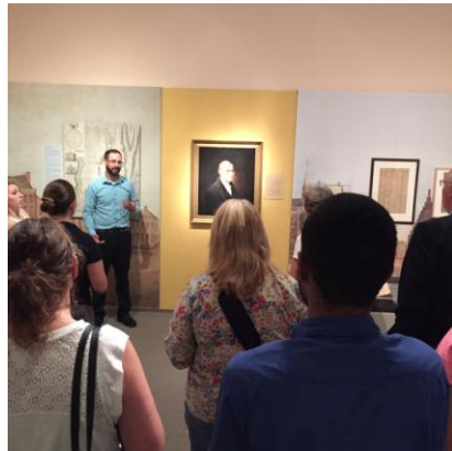
Tour of Spotlight: Alexander Hamilton

During the summer and fall, weekly gallery talks led visitors through the exhibition Spotlight: Alexander Hamilton . The programs, scheduled every Thursday in collaboration with Schuylar Mansion Historic Site, were very popular with adults and families. A total of 100 people attended the 16 gallery talks from July through October.