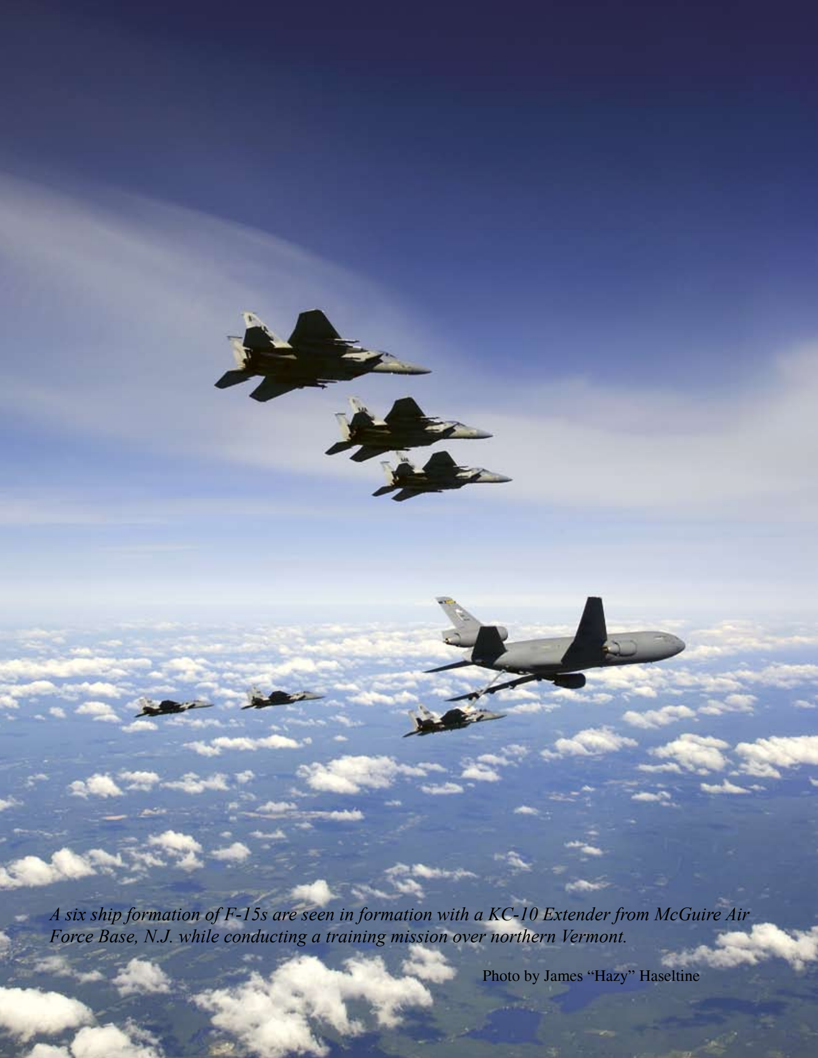
A six ship formation of F-15s are seen in formation with a KC-10 Extender from McGuire Air Force Base, N.J. while conducting a training mission over northern Vermont.