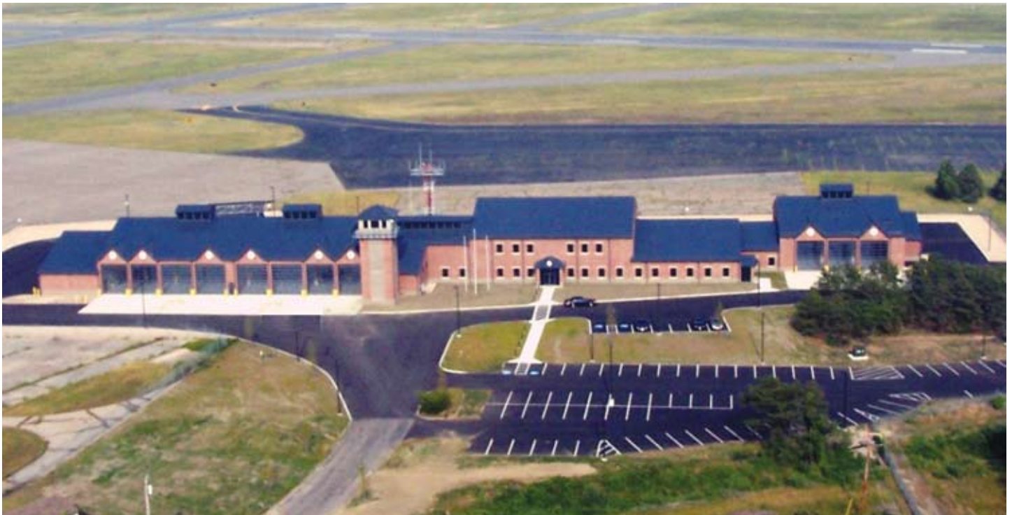
The new Otis Fire Crash and Rescue Station

Each modernization step takes us closer to realizing the potential of this unique military resource that just a few years ago seemed inconceivable. Today, the MMR is a national model for environmentally responsible, innovative reuse of our military facilities.