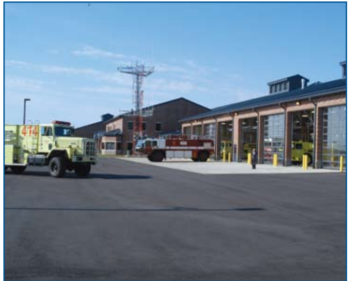
Fire bay from rear side of station.