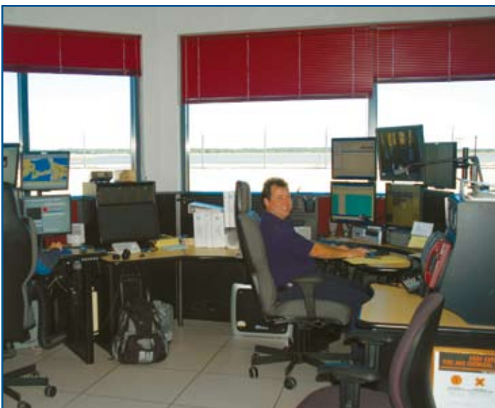
Command and control dispatch room.