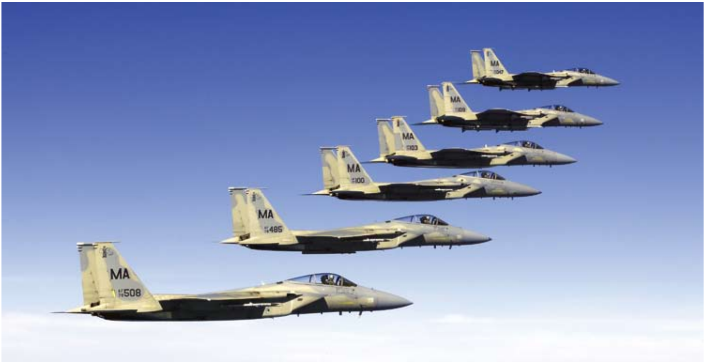
A six ship formation of F-15s fly up the coast of Massachusetts on their way to a military training area in Vermont for an aerial refueling mission with a KC-10.