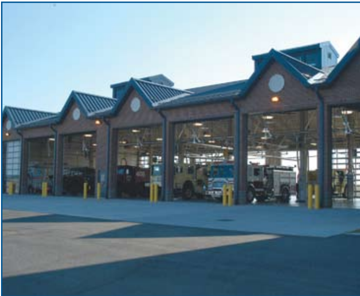
Fire bay from front side of station.