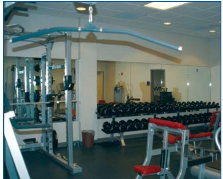
Physical training room.