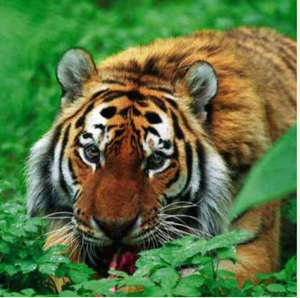
Intact forest landscapes of the Russian Far East provide invaluable habitat for the Amur tiger.

than 50 per cent (but not less than 30 per cent) if companies reach consensus with all stakeholders for the official protected status of the core areas.