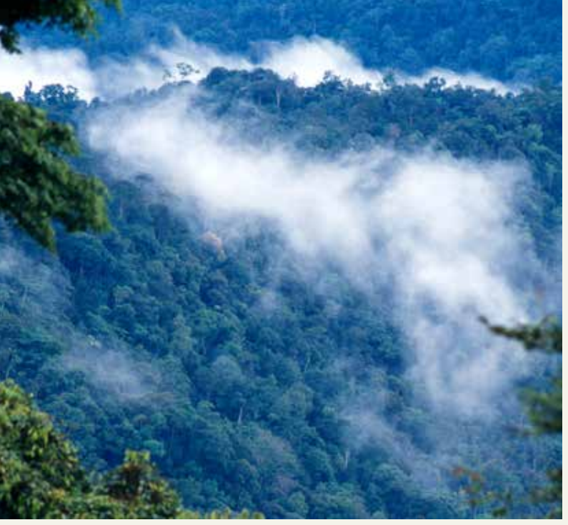
Forest after rain, Kalimantan (Borneo), Indonesia.