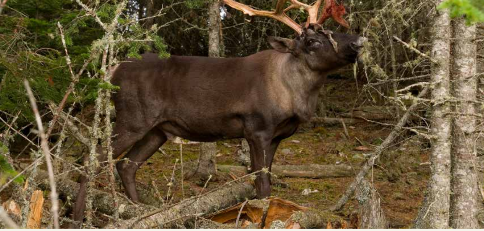
A woodland caribou in the boreal forest in Slate Islands, Ontario, Canada.