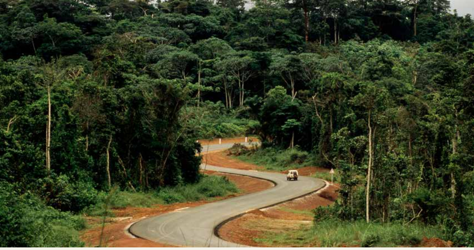
Road west of Minkébé Forest Gabon.