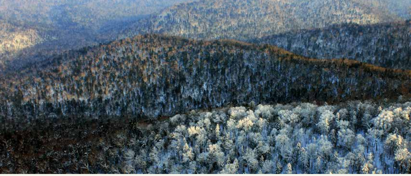
Intact forests in the Bikin River basin, Russian Far East.