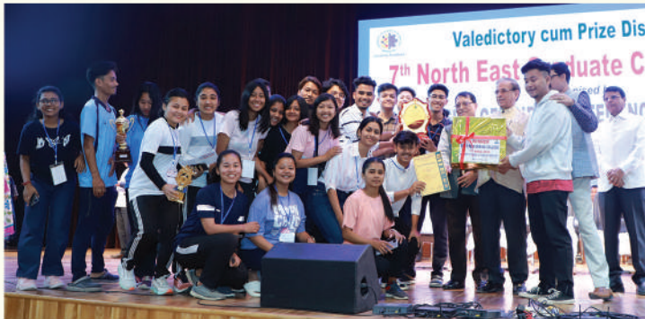
Best Performing College award in NEGC-2023 to Sibsagar College

Attractive awards, including two-wheelers, laptops, tablets, mobile phones and cash prizes will be given to the winners of different competitions. Special attractions in the award category are: 'Best Performing College-2023' and 'Best Magazine Award-2023'. Certificates of participation would be given to all the participants. Prizes worth Rs 50 lakh will be awarded to the winners of various competitions in the event.