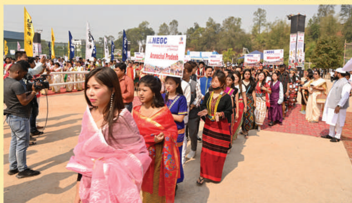
Cultural rally showcasing 8 states of NE at NEGC-2023