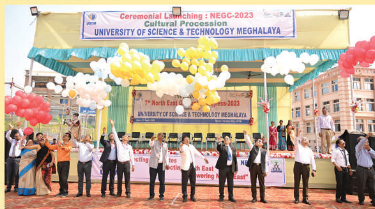
Launching of NEGC-2023 at USTM