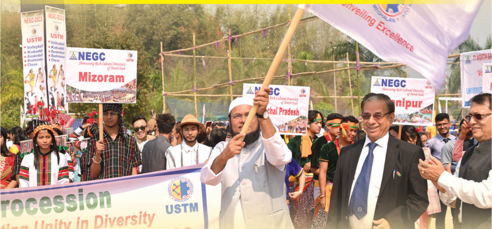
Ceremonial flag off of NEGC-2023 at USTM