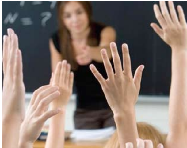
The teacher, photo

T HE FOURTH EPOCHAL REVELATION—the one brought by our Creator Son to his world under the human identity of Jesus of Nazareth—is very closely related to the next one, the fifth epochal revelation contained in The Urantia Book . That may be why, when we read Part IV of the book, we cannot help feeling the midwayers in charge of the revelation of the life and teachings of Jesus are not just describing the facts of the seventh bestowal of Michael of Nebadon, but also conveying very valuable insights for the success of the fifth epochal revelation.