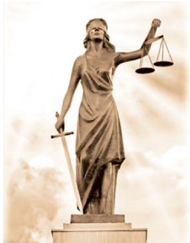
Justice statue a symbol of impartiality

It is our personal and collective decisions, coupled with the accidents of time, which entail the consequences through which we have to struggle. Personal decisions are those that we have the most control over. For example, we can decide to not physically exercise regularly but this augments the risk of aging with handicaps. Collective decisions are constituent of the orientations we indulge in as a society and which has influence on the fate of each individual. Generally speaking, we have less control on